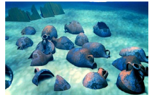
3. 3D- reconstruction photogrammetry