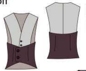
Vest 002 Cotton/Polyester Brocade/Twill xs - ssl $50