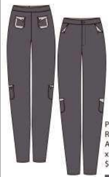
Pant 003 Rayon/Acetate Antique Satin xs - xxl $70