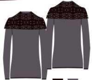
Shirt 002 Bamboo/Polyester Knit xs - xxl $35