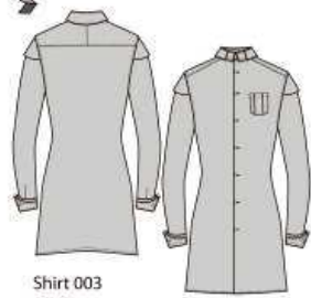
Shirt 003 Cotton xs - xxl $80