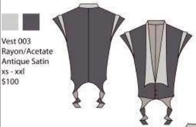
Vest 003 Rayon/Acetate Antique Satin xs - xxl $100