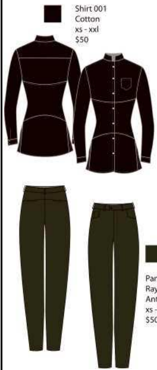
Shirt 001 Cotton xs - xxl $50