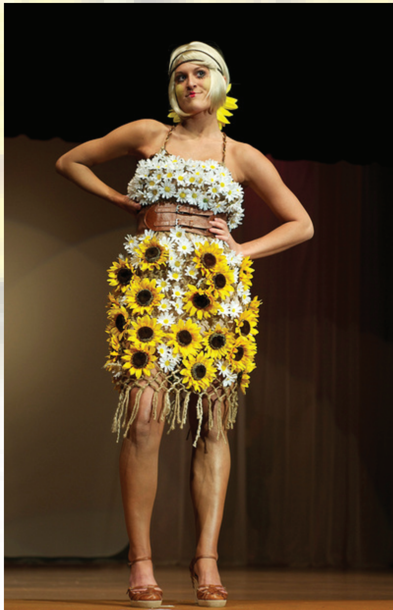
UNI Student Design Show 2010