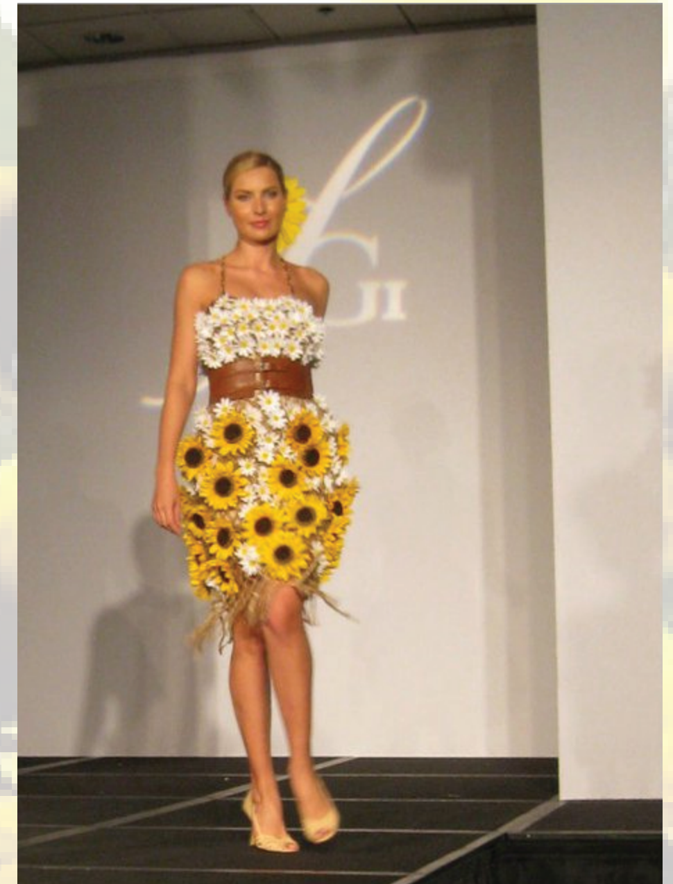
Fashion Group International Student Show in Chiago 2010