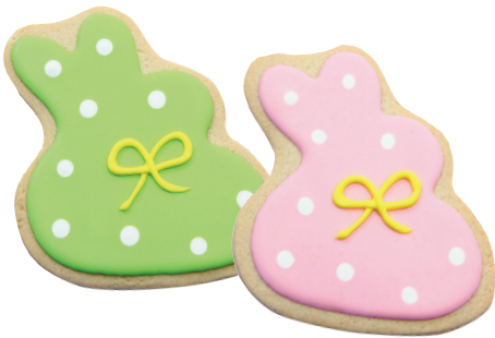
POLKA DOT BUNNIES Item Number: 14232 Available: January - February