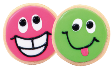
FUNNY FACES Item Number: 14522 Available: Everyday