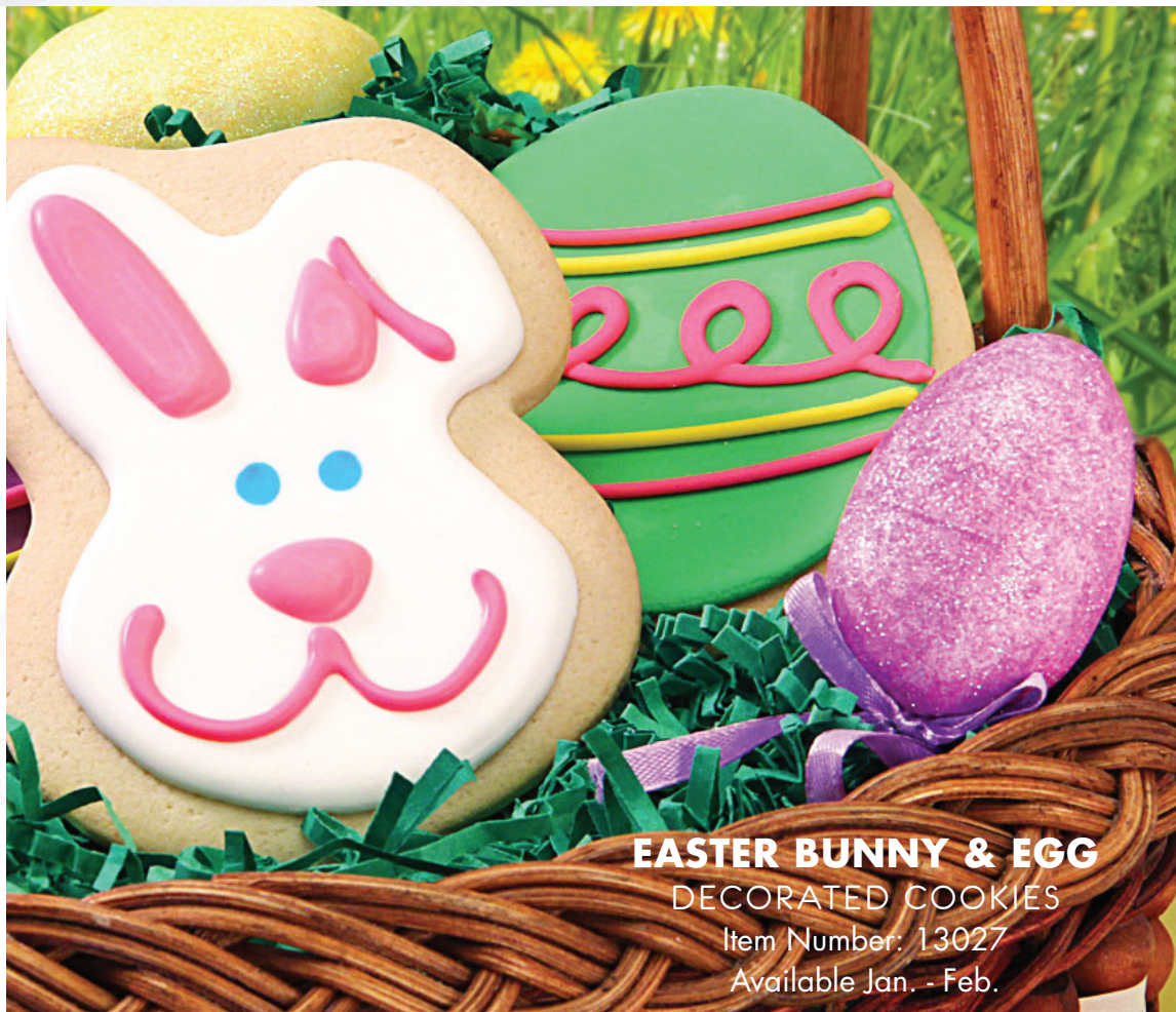
EASTER BUNNY & EGG DECORATED COOKIES Item Number: 13027 Available Jan. - Feb.