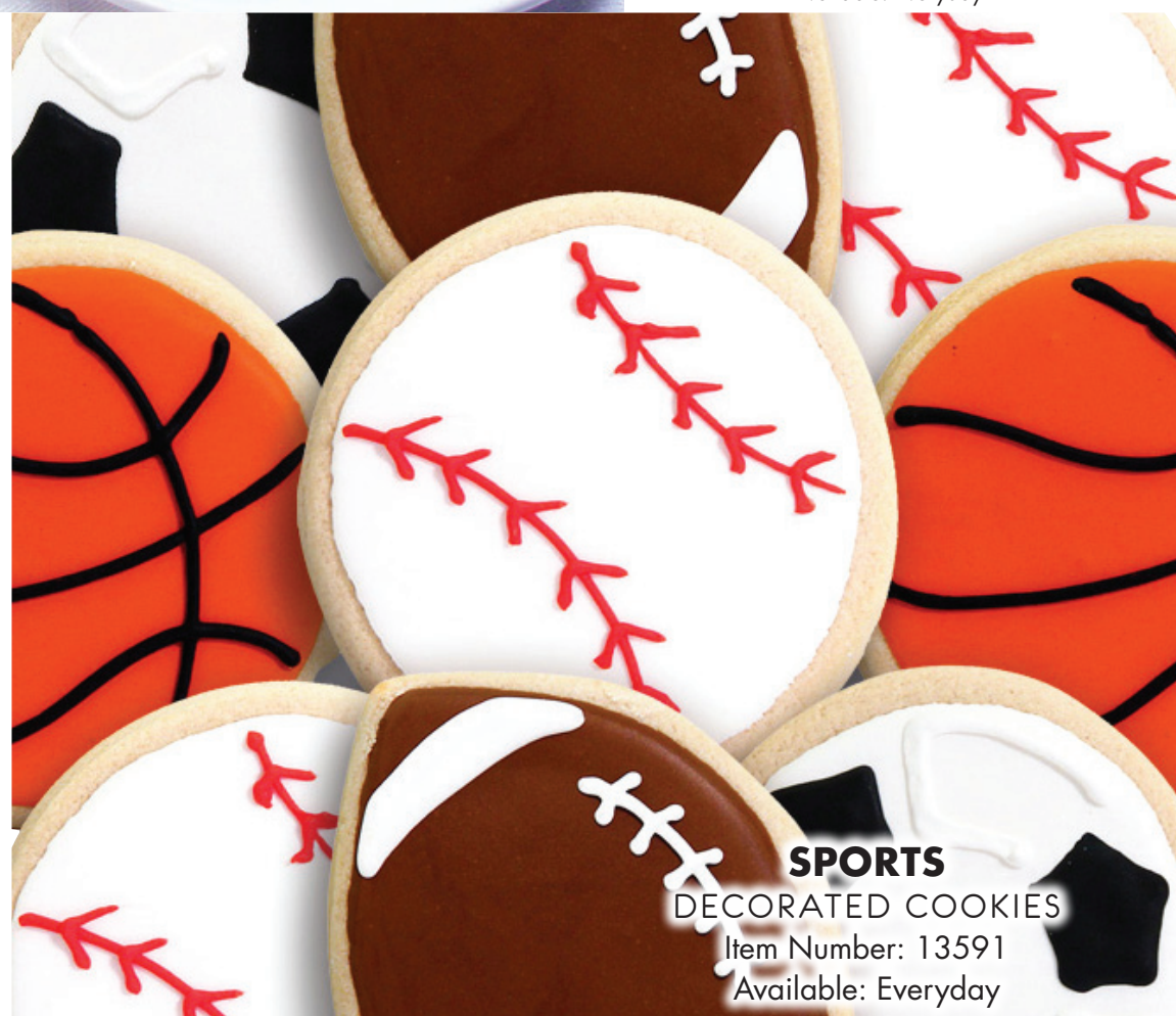
SPORTS DECORATED COOKIES Item Number: 13591 Available: Everyday