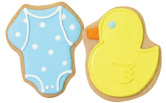
BABY BOY Item Number: 13522 Available: Everyday