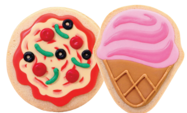
SNACK ATTACK Item Number: 14539 Available: Everyday