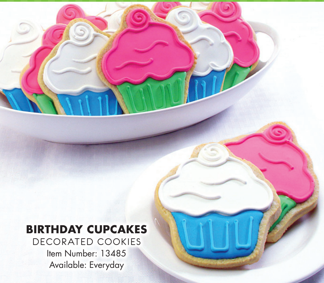
BIRTHDAY CUPCAKES DECORATED COOKIES Item Number: 13485 Available: Everyday