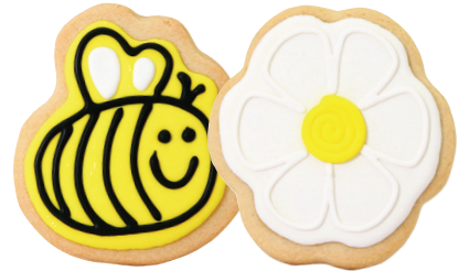
BUMBLE BEE & WHITE FLOWER Item Number: 14119 Available: Everyday