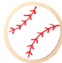
BASEBALL Item Number: 13595 Available: Everyday