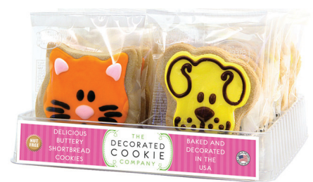
CAT & DOG Item Number: 14096 Available: Everyday