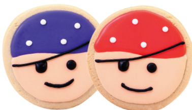
PIRATES Item Number: 14515 Available: Everyday