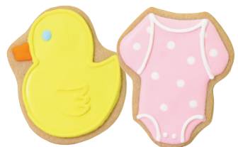
BABY GIRL Item Number: 13553 Available: Everyday