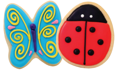
BUTTERFLY & LADYBUG Item Number: 13379 Available: Everyday