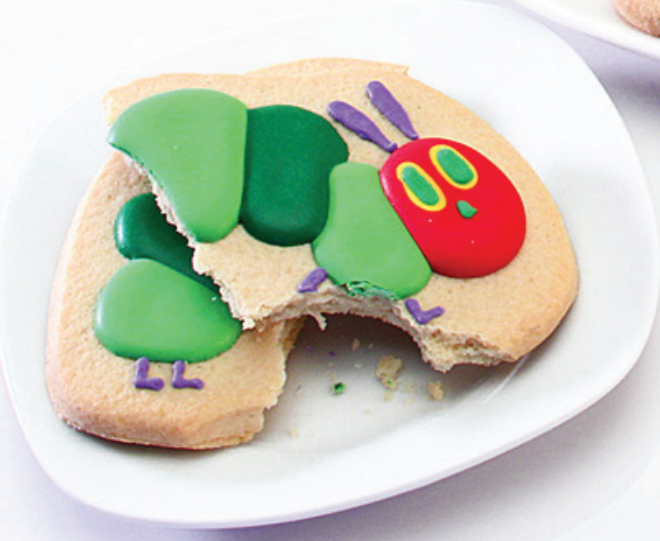
THE VERY HUNGRY CATERPILLAR DECORATED COOKIES Item Number: 12990 Available: Everyday