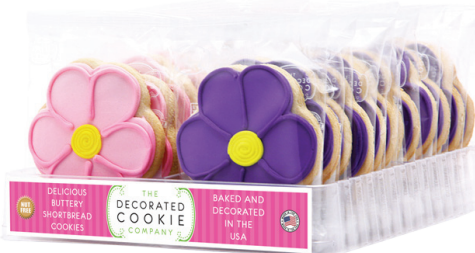
PINK & PURPLE FLOWERS Item Number: 13393 Available: Everyday