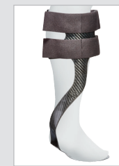
Carbon Fiber AFO p. xxx