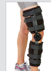
FREEDOM® comfort™ Post-Op Knee Brace p. xx