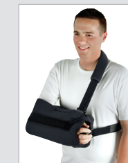
Shoulder Immobilizer p. xxx