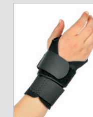
FREEDOM® Pediatric Wrist Support p. xxx