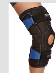
FREEDOM® Soft OA Hinged Sleeve p. xxx