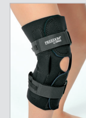
FREEDOM® Pediatric Wraparound Knee Brace p. xxx