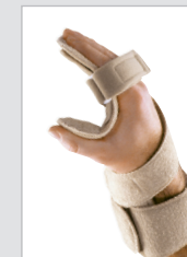
Omni Progressive™ WHT Orthosis™ p. xxx