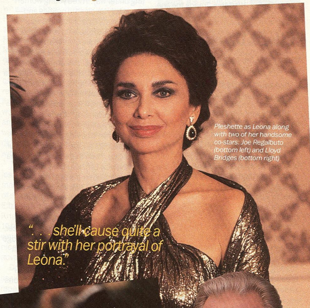
Pleshette as Leona along with two of her handsome co-stars: Joe Regalbuto (bottom left) and Lloyd Bridges (bottom right)