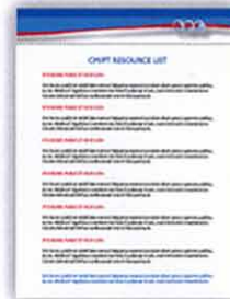
Resource Tear Pad