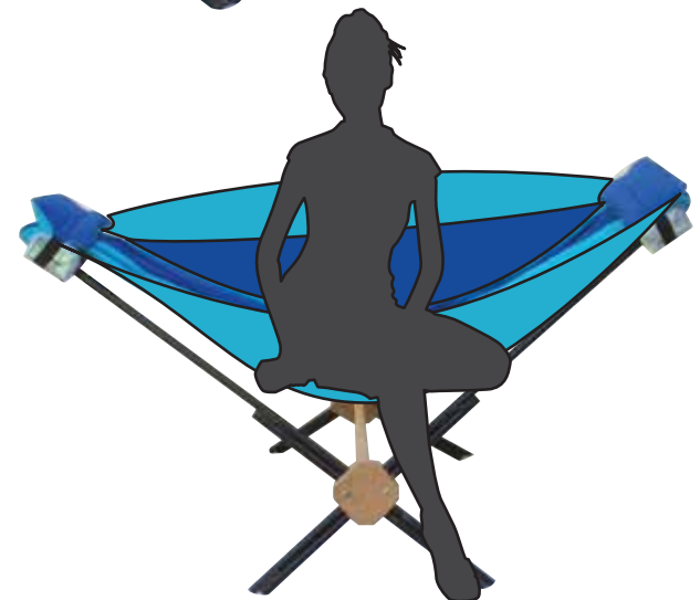
LOUNGE STYLE WITH BACK SUPPORT