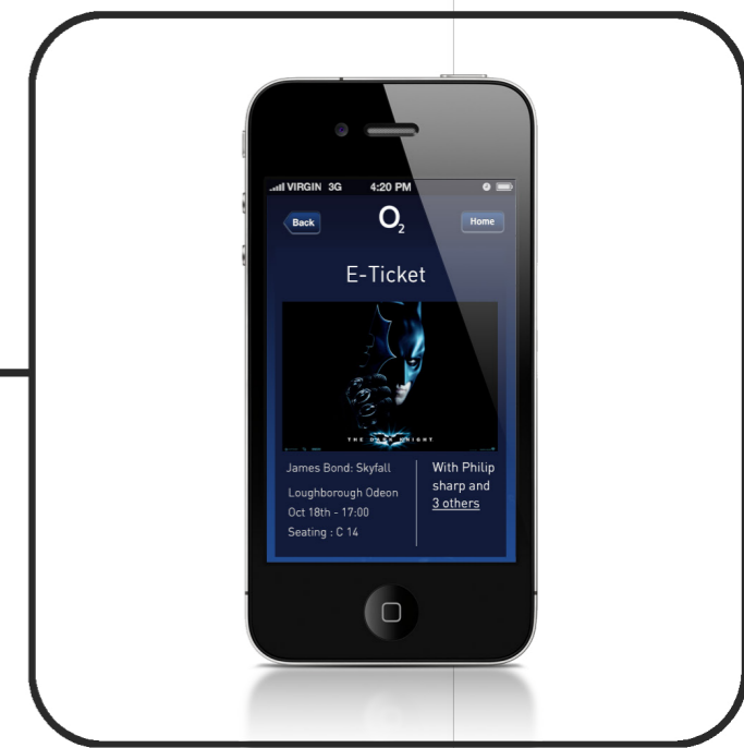
Recieve virtual ticket: Once the payment is confirmed James recieves a virtual ticket which is stored within the app.