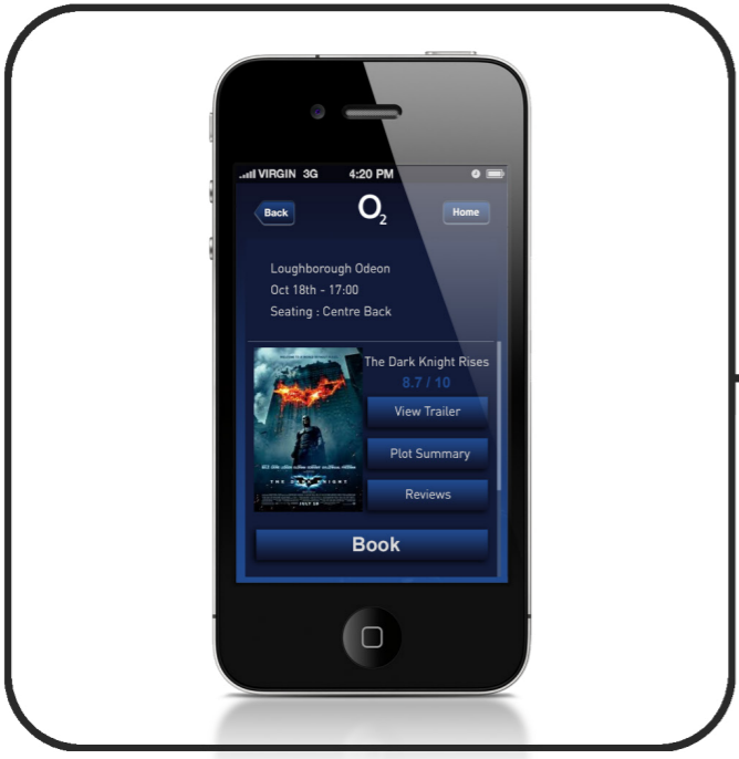
Film Information: Once the app has loaded information for the selected film such as trailers and release date is shown.