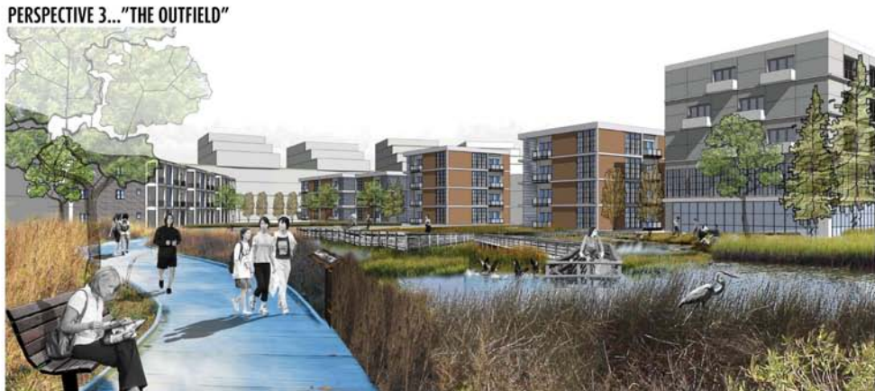
PERSPECTIVE 3... "THE OUTFIELD"