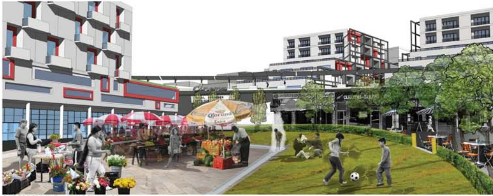
PERSPECTIVE 2... "THE INFIELD"