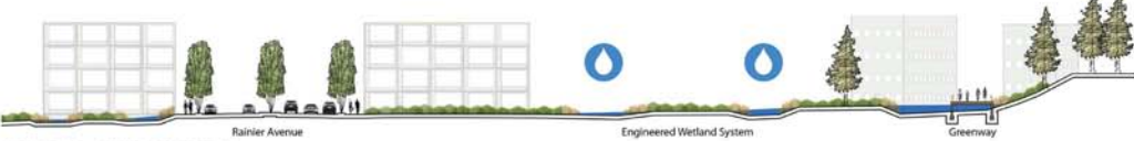
SECTION 3... "THE OUTFIELD" East-West Looking South