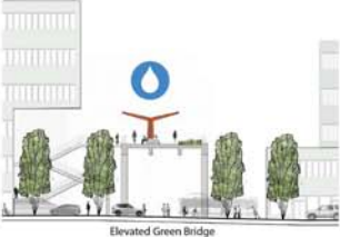
SECTION 1... McCLELLAN BRIDGE East-West Looking South