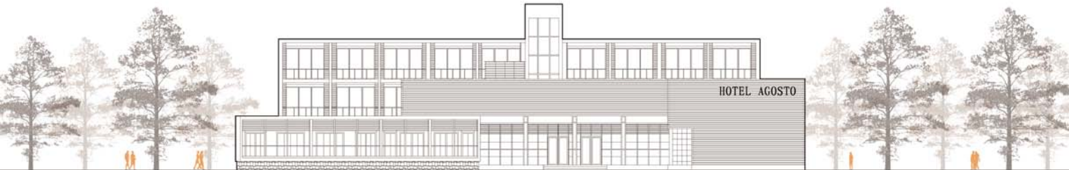
Southern Elevation Plan