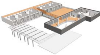
Roof Terrace and Corridor