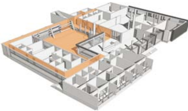
Central Courtyard and Corridor

Front Street Entrance Plaza Reception Hall Connecting Corridor Stair Case Corridor