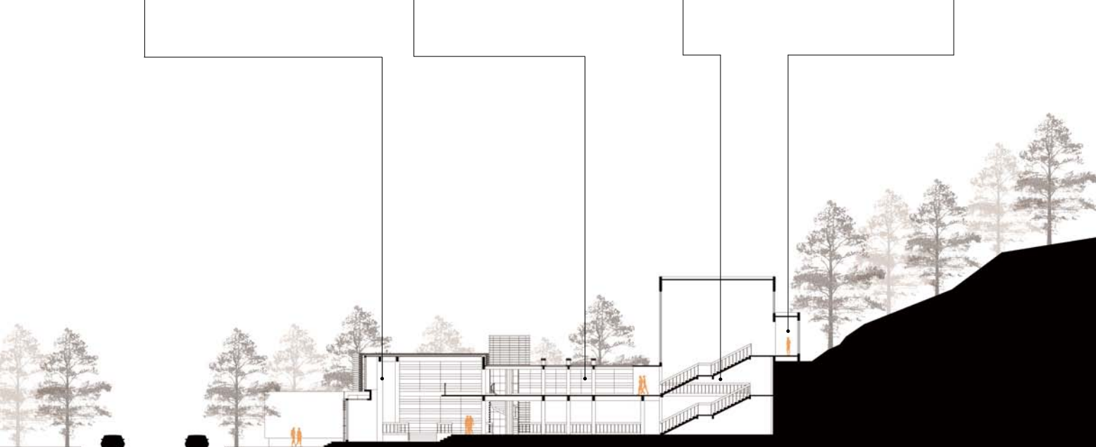
A - A Section Plan

Front Street Entrance Plaza Reception Hall Connecting Corridor Stair Case Corridor