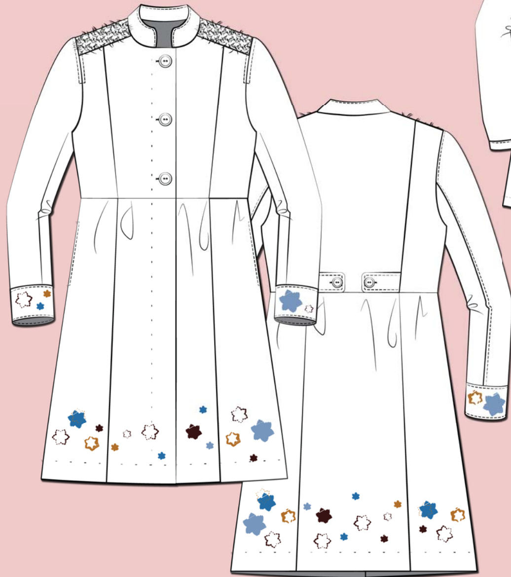
SP-0733-4 WOOL COAT MANDARIN COLLAR THREE-BUTTON CLOSURE PRINCESS SEAMS EMBROIDERY DETAILING FAUX FUR TRIM ON SHOULDERS WAIST CINCHES AT THE BACK 100% WOOL