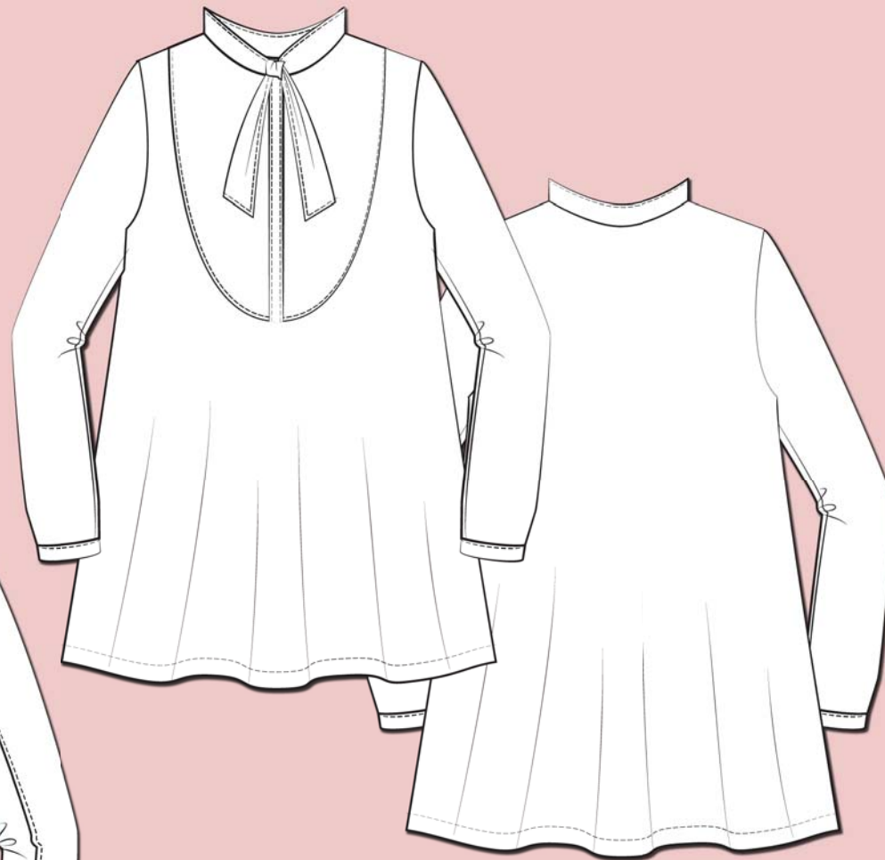
SP-8917-1 TIE-FRONT BLOUSE MANDARIN COLLAR CONCEALED BUTTONS 100% SILK