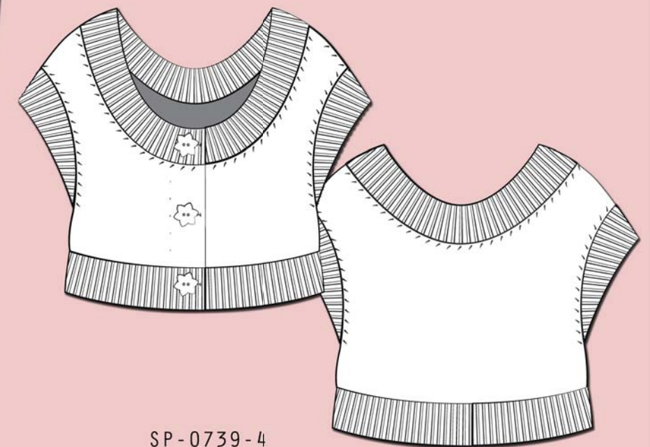
SP-0739-4 CHUNKY KNIT SWEATER THREE-BUTTON CLOSURE RIBBED TRIM, FULL FASHIONED 100% PIMA COTTON