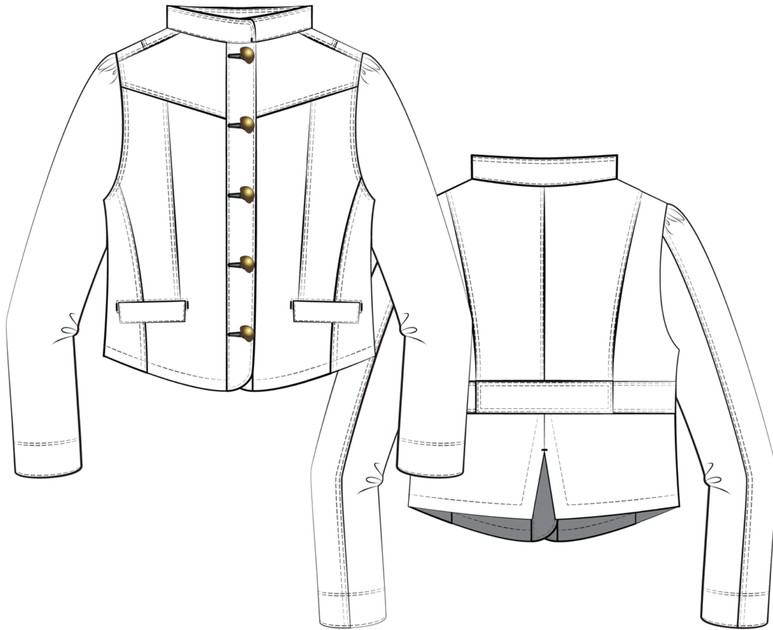
TECHNICAL FLAT SKETCH