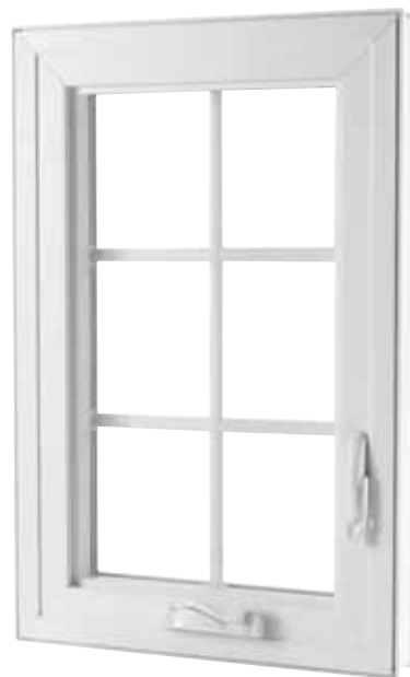
CASEMENT DECORATIVE GLASS Refer to back cover for options.