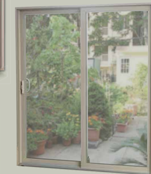
2 panel patio door available in 3 panel