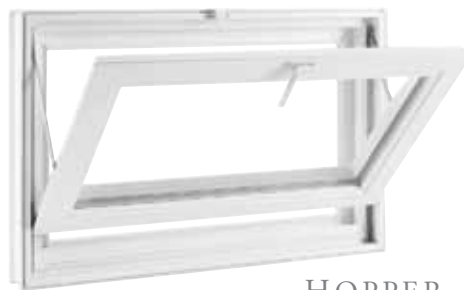
HOPPER Upgrade and modernize your basement.