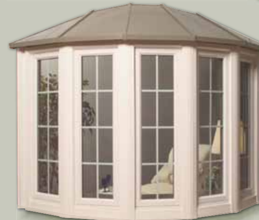
3 to 6 light bows aluminum hip roof in sierra tan*

Windows in a bow are all the same size. Picture windows are flanked by two operable windows.