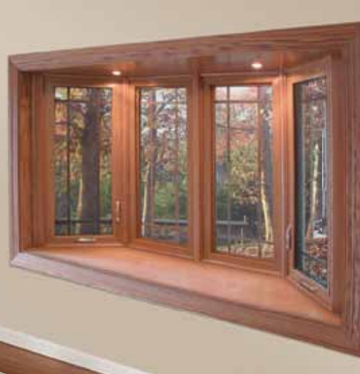
4 lite bay recessed halogen lighting* edge banding and casing*

Add an herb garden to your kitchen with a garden window. These custom built units are structurally strong and extremely well insulated.