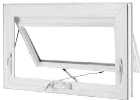
AWNING Enjoy fresh air even on rainy days.