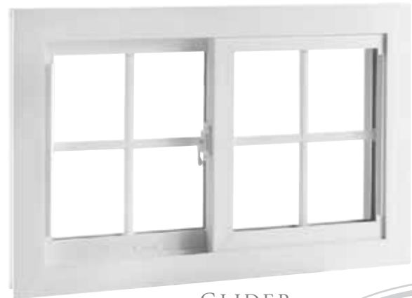
GLIDER Sash glide easily on brass rollers and remove from inside for easy cleaning. Offered in two or three lite styles. Refer to back cover for configurations.

Sample size windows are pictured to illustrate details. Proportion of frame to glass will be thinner in full size windows. Meeting rail sash 30" and over feature 2 sash locks. Hopper - NA brown or wood grains