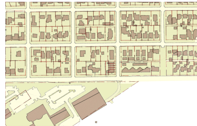
Computer-Assisted Diagram Appearing as Freehand Rendering