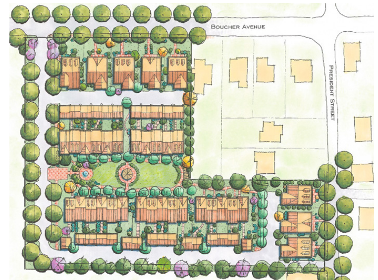
Urban Infill - Annapolis, Maryland 2004