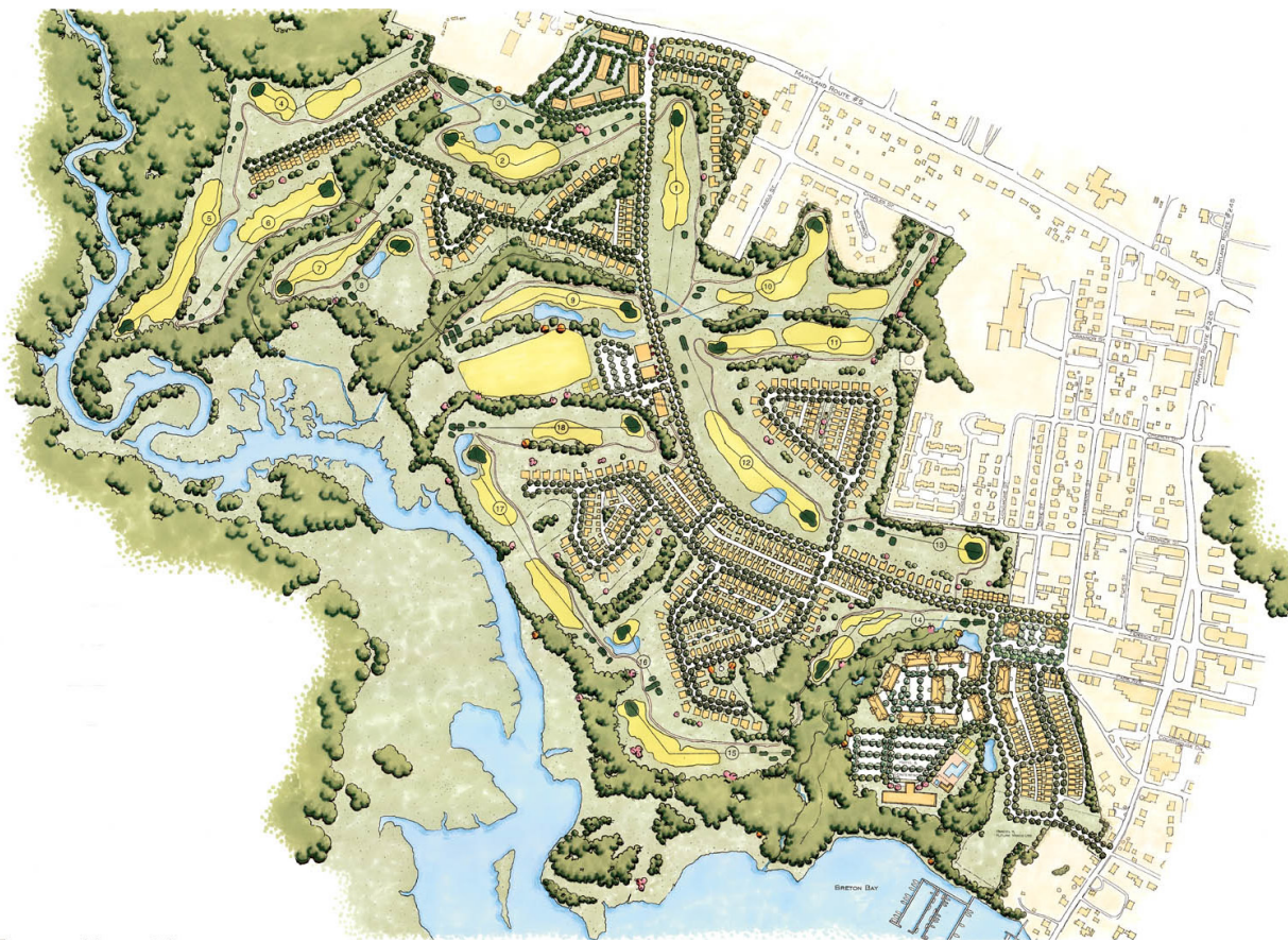
Tudor Hall Village - St. Mary's, Maryland 2004