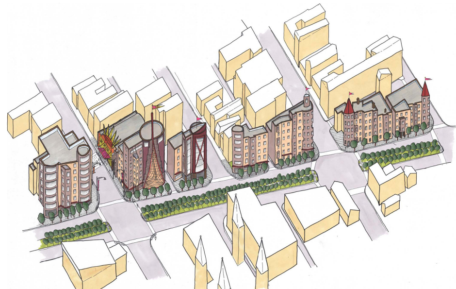
Axonometric perspective- urban corridor infill plan