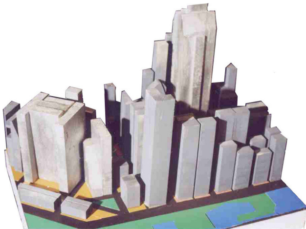
Model- urban scene with zoning and setback requirements