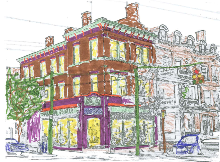
Vignette sketch- neighborhood business district analysis