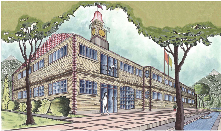
Perspective- recreation center