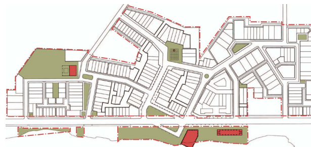
Civic Space Diagram