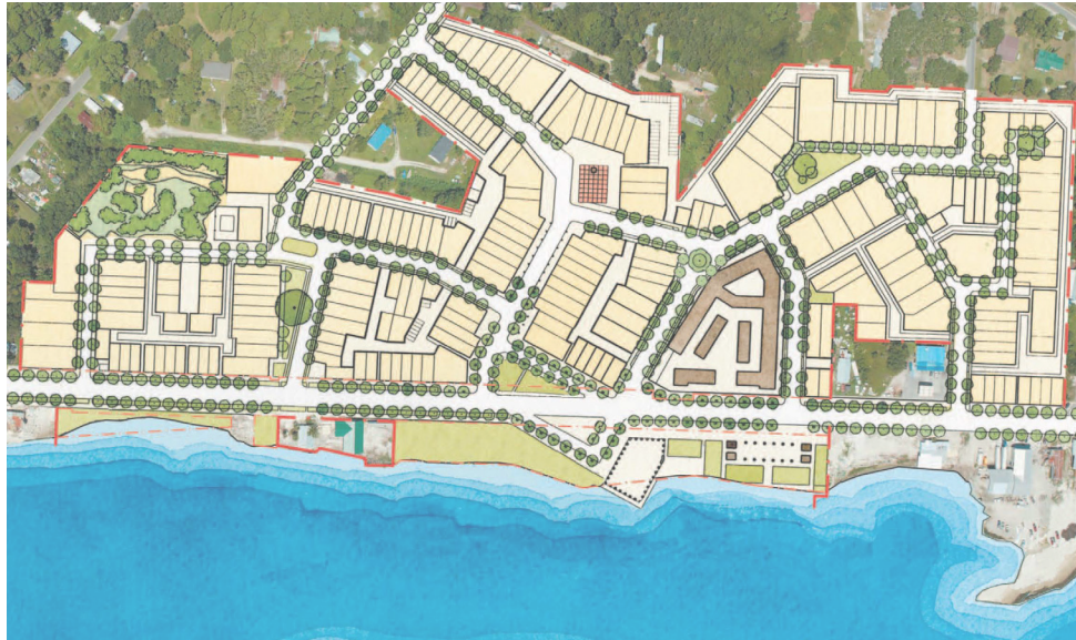
Illustrative Master Plan