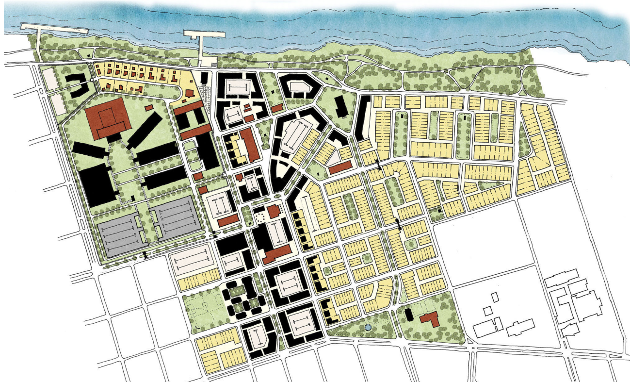
Illustrative Master Plan