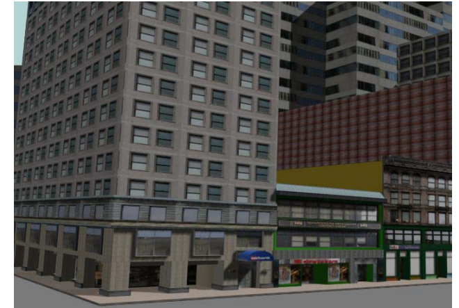
3D Rendering Detail View