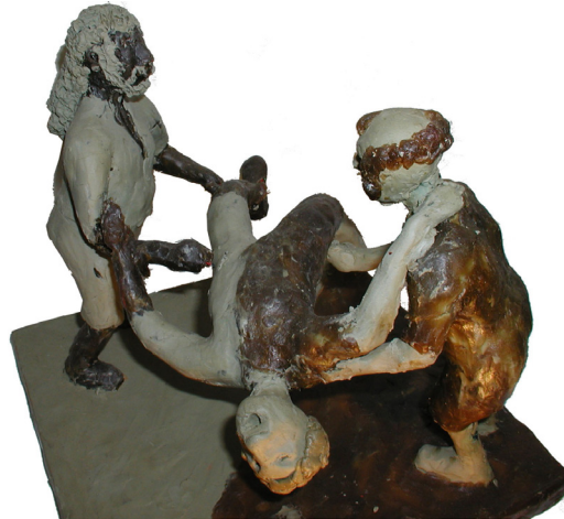
Study with Wax and Plasticine