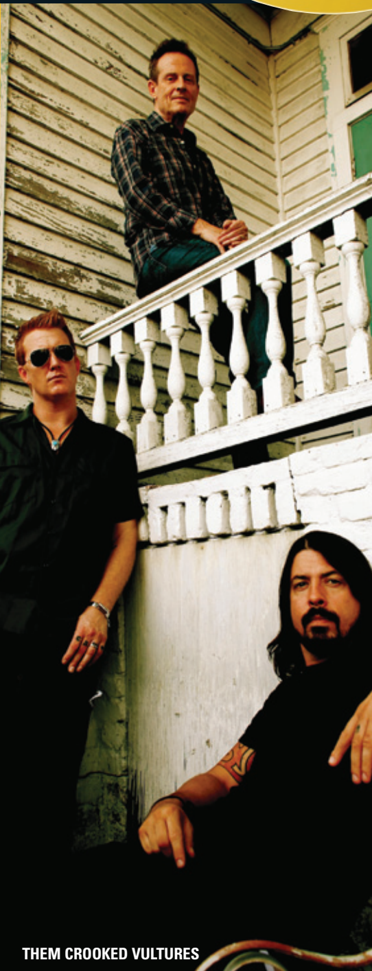
THEM CROOKED VULTURES