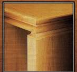
Double Radius Detail