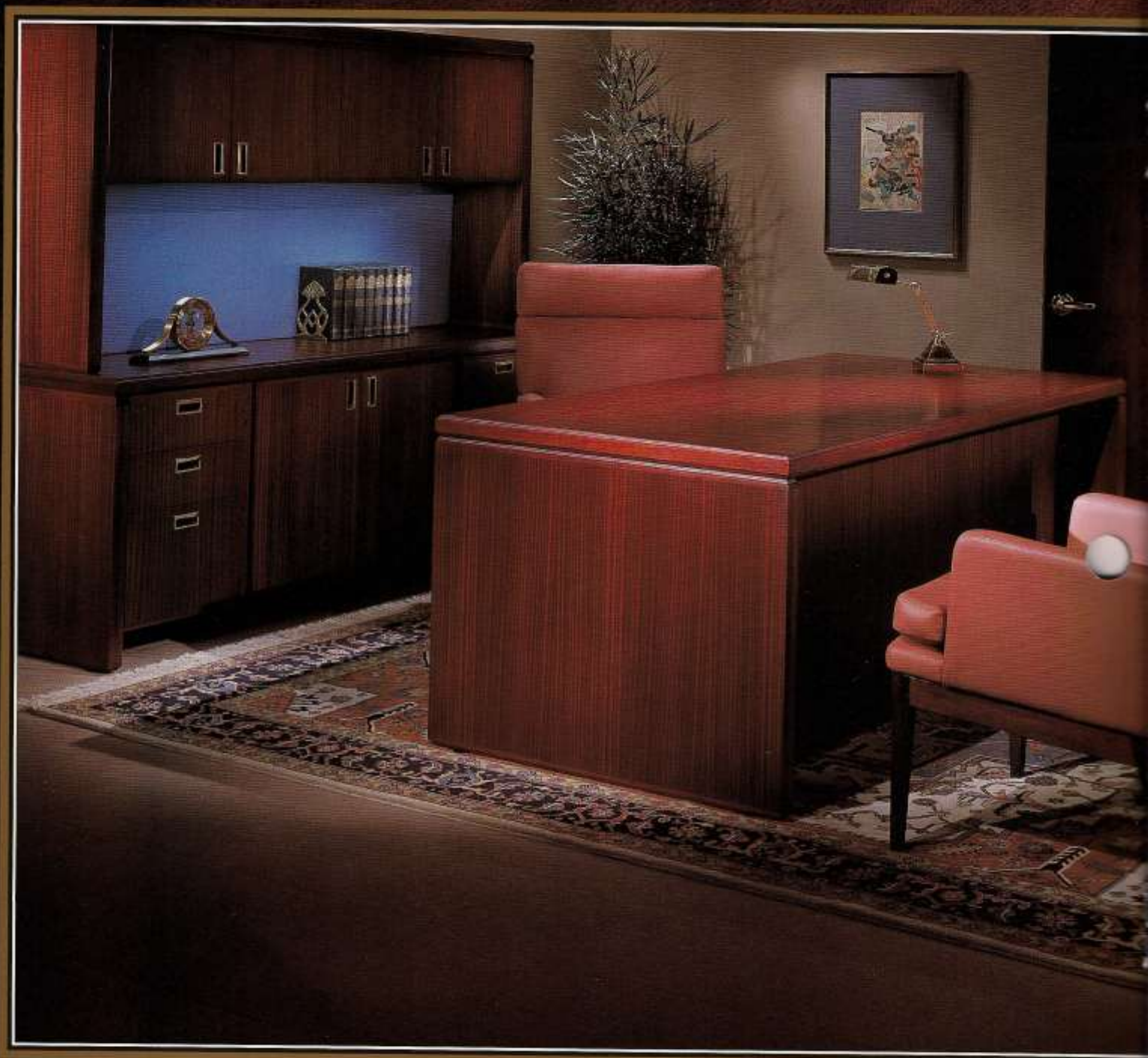
Becker Desk with Ogee Edge