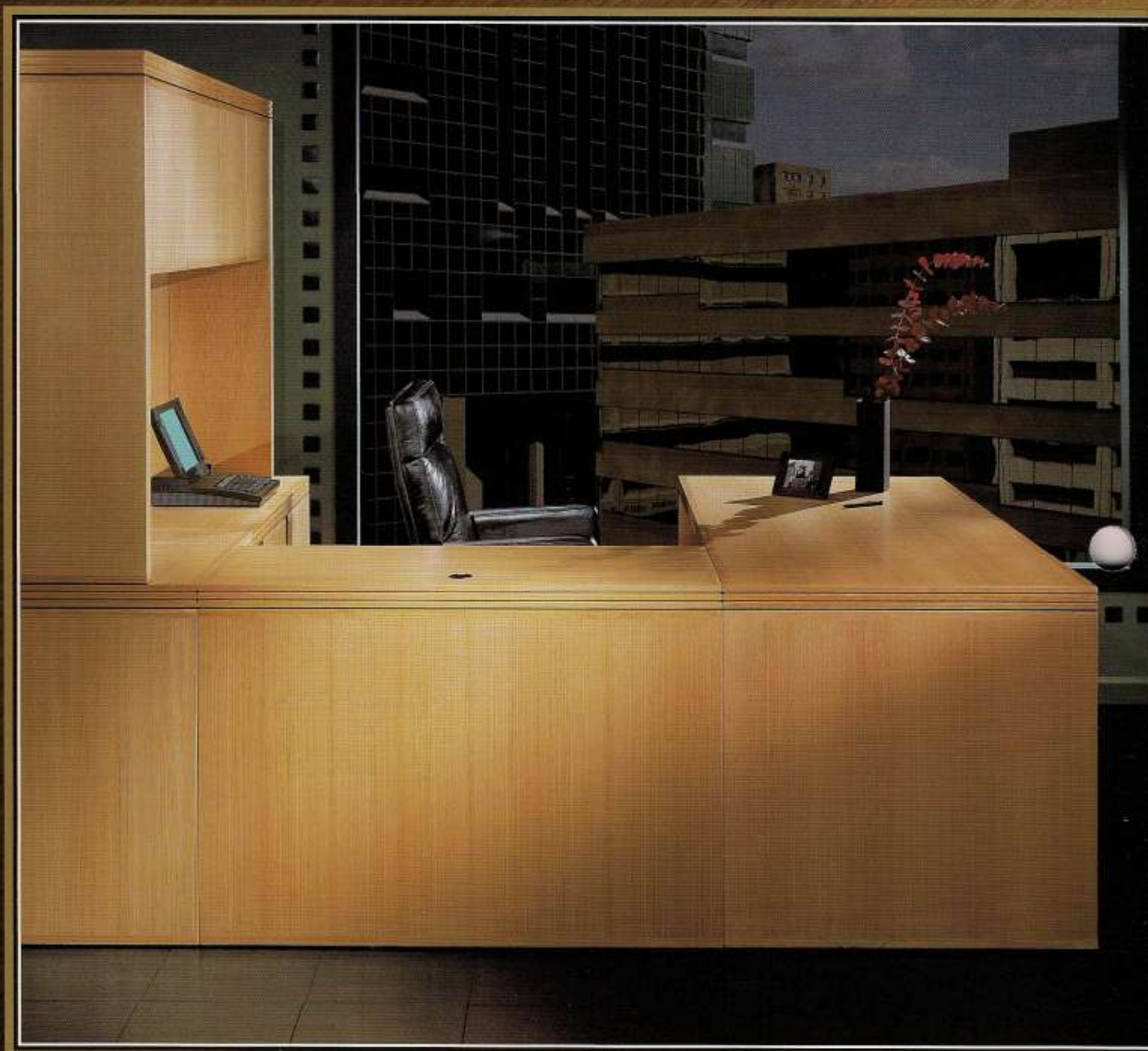
Becker Desk with Rectilinear Edge