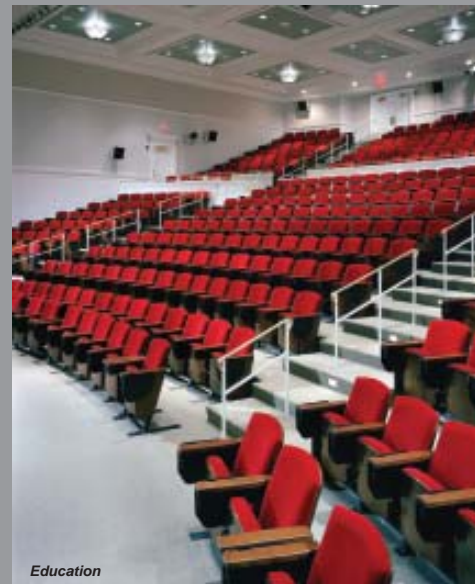
Education The University of Virginia, Darden Auditorium