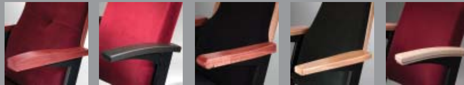
Custom arm rests