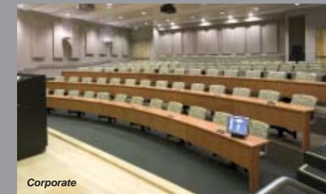
Corporate ViaSat Corporate Headquarters