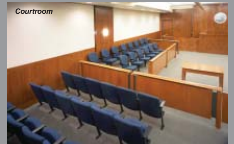
Courtroom Napa County Criminal Court Building