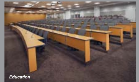
Education University of Medicine & Dentistry of New Jersey

Herman Miller's Equa 2 chair was originally designed as a high performance office chair; many of its key design elements make it an ideal lecture/training room chair. The seat and back of the one-piece shell flex independently, providing passive support for users as they shift body position and posture. The opening between the seat and back lets air circulation keep the occupant cool.