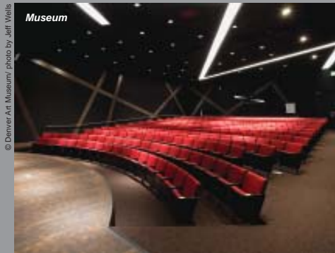
Museum The Denver Art Museum - Lewis I. Sharp Auditorium

The Acclaim includes options such as tablet arms, power/data frames, aisle lights, ADA frames, removable chair assemblies, ID and donor plates.