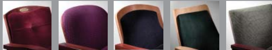
Custom back shapes

TSI's staff includes experienced product designers capable of creating products and components which may be required to address unique project specifications. Our manufacturing infrastructure is flexible, which allows for economical and efficient production of custom products. Shown below are some of the custom designs produced for a variety of projects.