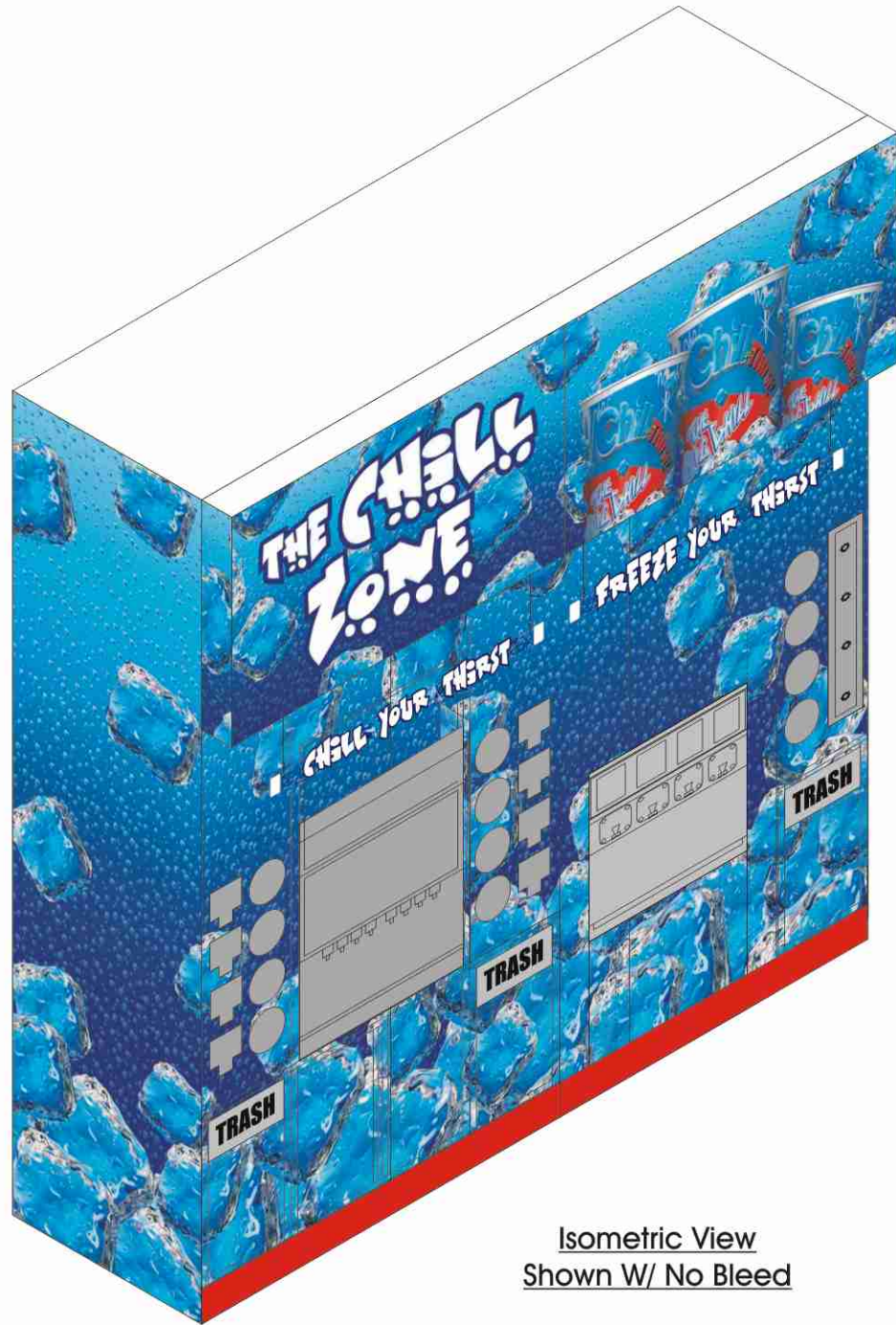
Isometric View Shown W/ No Bleed