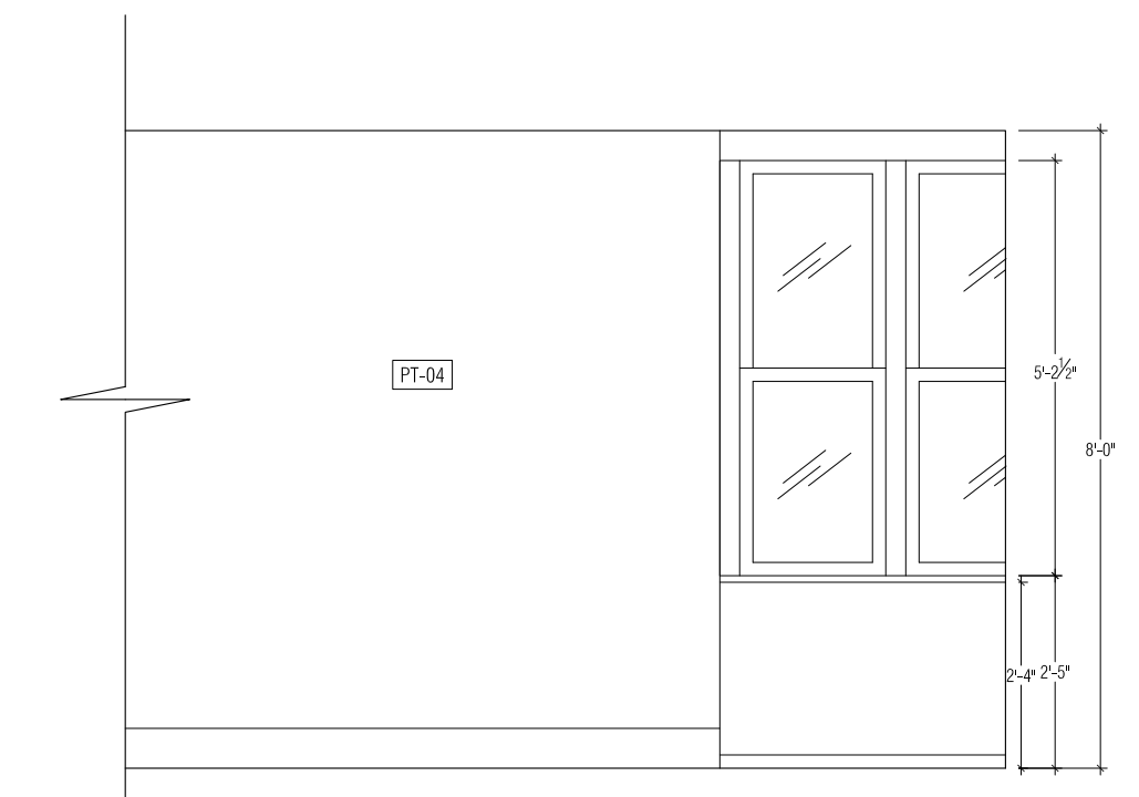
4 DINING ROOM ELEVATION: RM #1106 SCALE: 3/8"=1'-0"