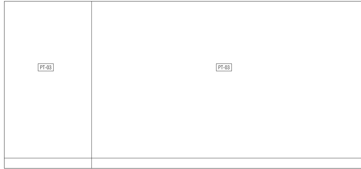
1 STUDY/GUEST ELEVATION: RM #1104 SCALE: 3/8"=1'-0"