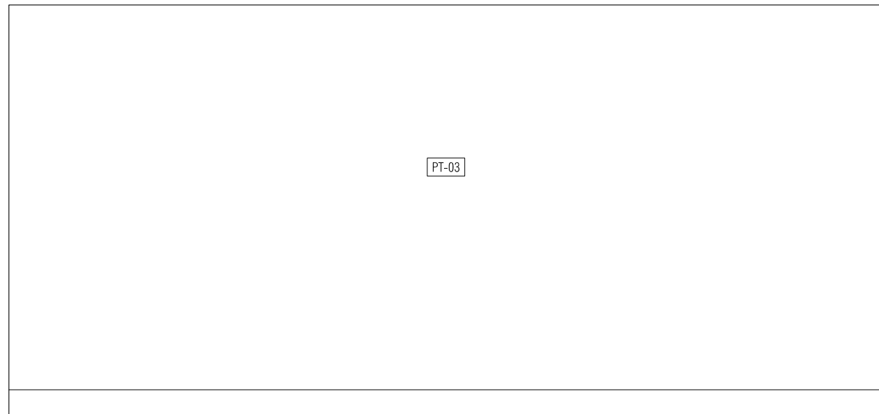
3 STUDY/GUEST ELEVATION: RM #1104 SCALE: 3/8"=1'-0"