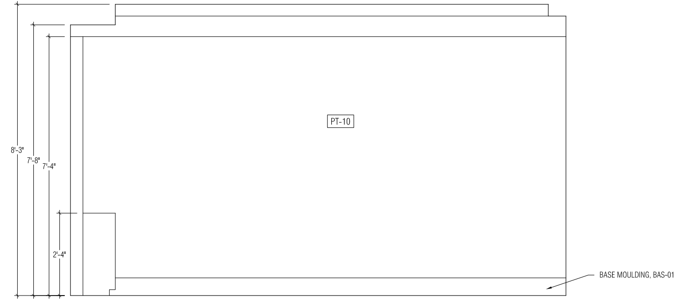
2 SON'S BEDROOM ELEVATION: RM #1112 SCALE: 3/8"=1'-0"