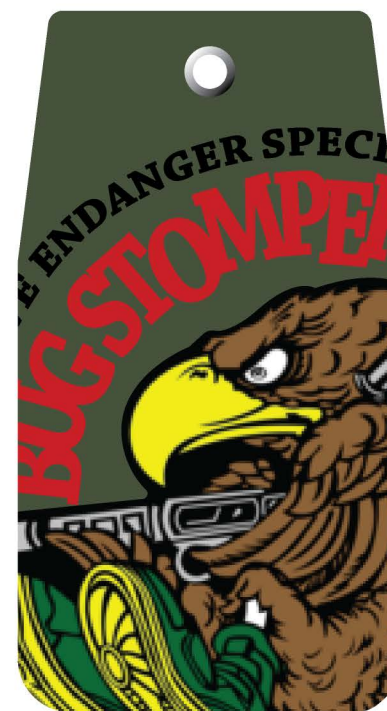
BUG STOMPER INSIGNIA