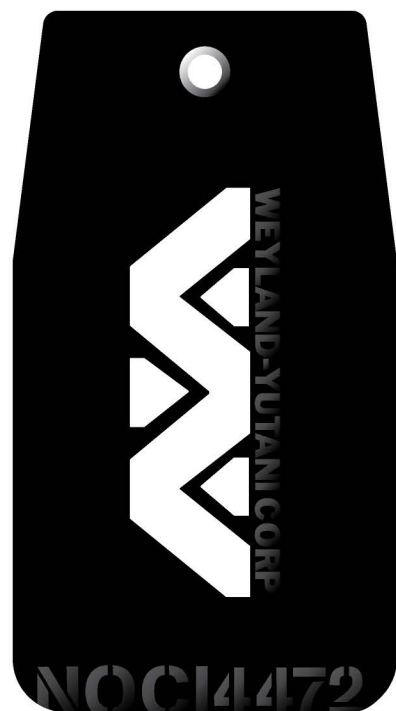
WEYLAND-YUTANI (THE COMPANY)