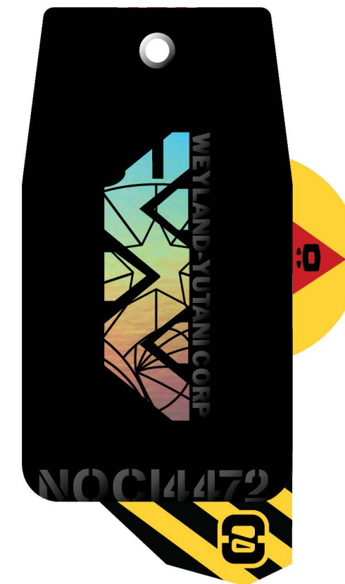
STACKED HANG TAGS

UNITED STATES COLONIAL MARINE CORPS (USCM), COMMONLY KNOWN AS THE COLONIAL MARINES