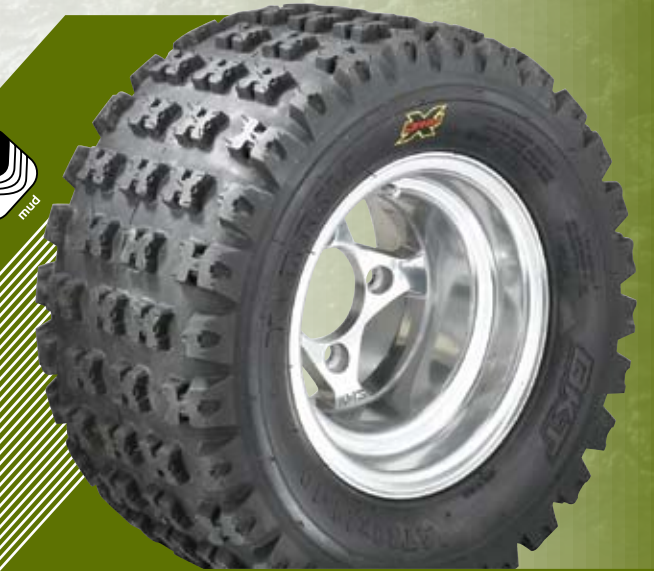
BKT X-DRIV REAR