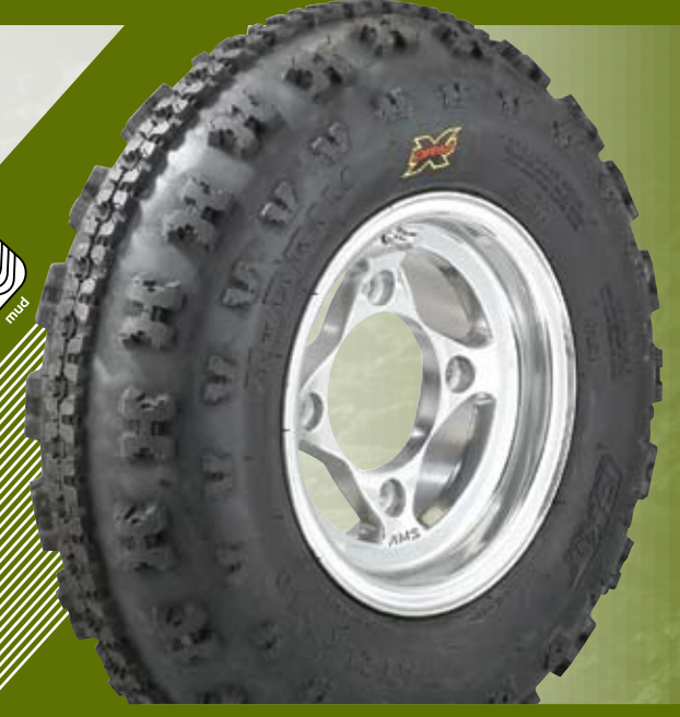
BKT X-DRIV FRONT