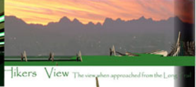
Hikers View The view when approached from the Long