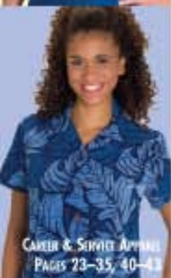
CAREER & SERVICE APPAREL PAGES 23-35, 40-43