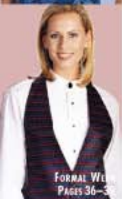
FORMAL WEAR PAGES 36-37