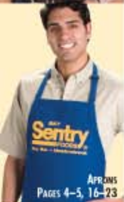
APRONS PAGES 4-5, 16-23