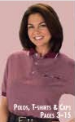
POLOS, T-SHIRTS & CAPS PAGES 3-15