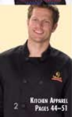
KITCHEN APPAREL PAGES 44-51