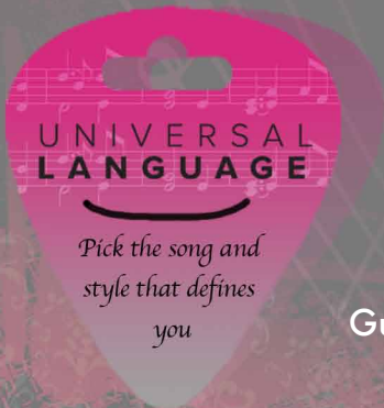
Guitar Pick Shaped Ring Card