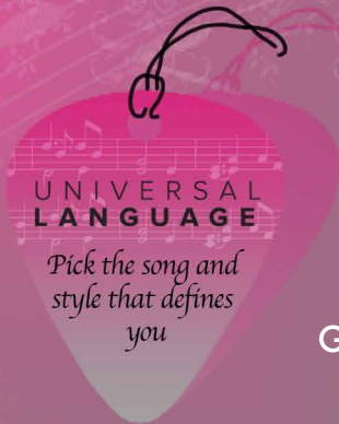
Guitar Pick Shaped Bracelet String Tag