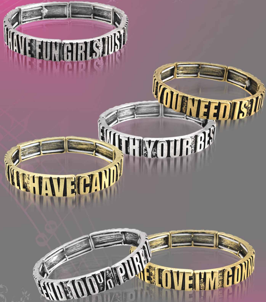
Stretch Music Bracelets $7