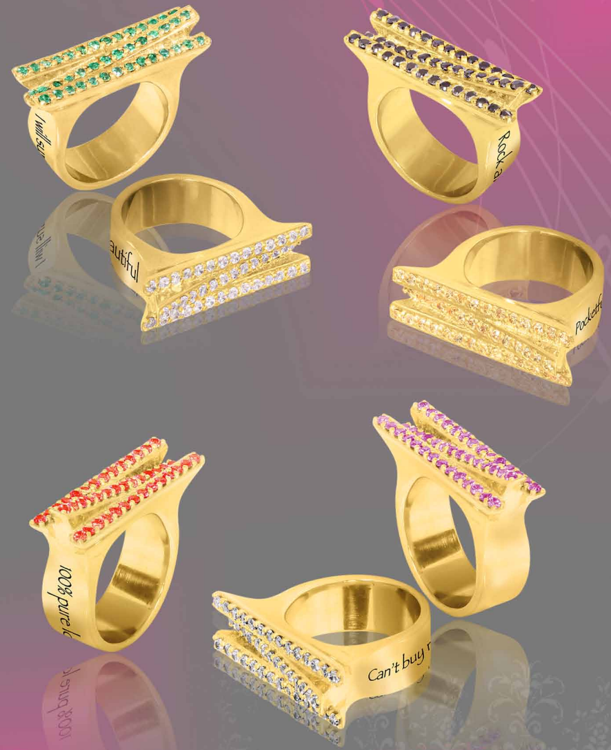
Crystal Triple Bar Rings $7