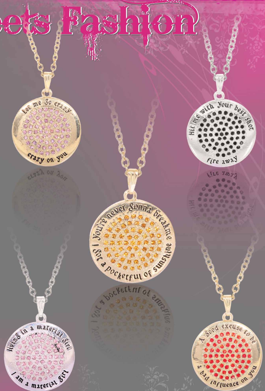
Color Crystal Coin Necklaces $7.50