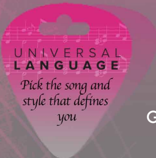
Guitar Pick Shaped Necklace Fold over Card