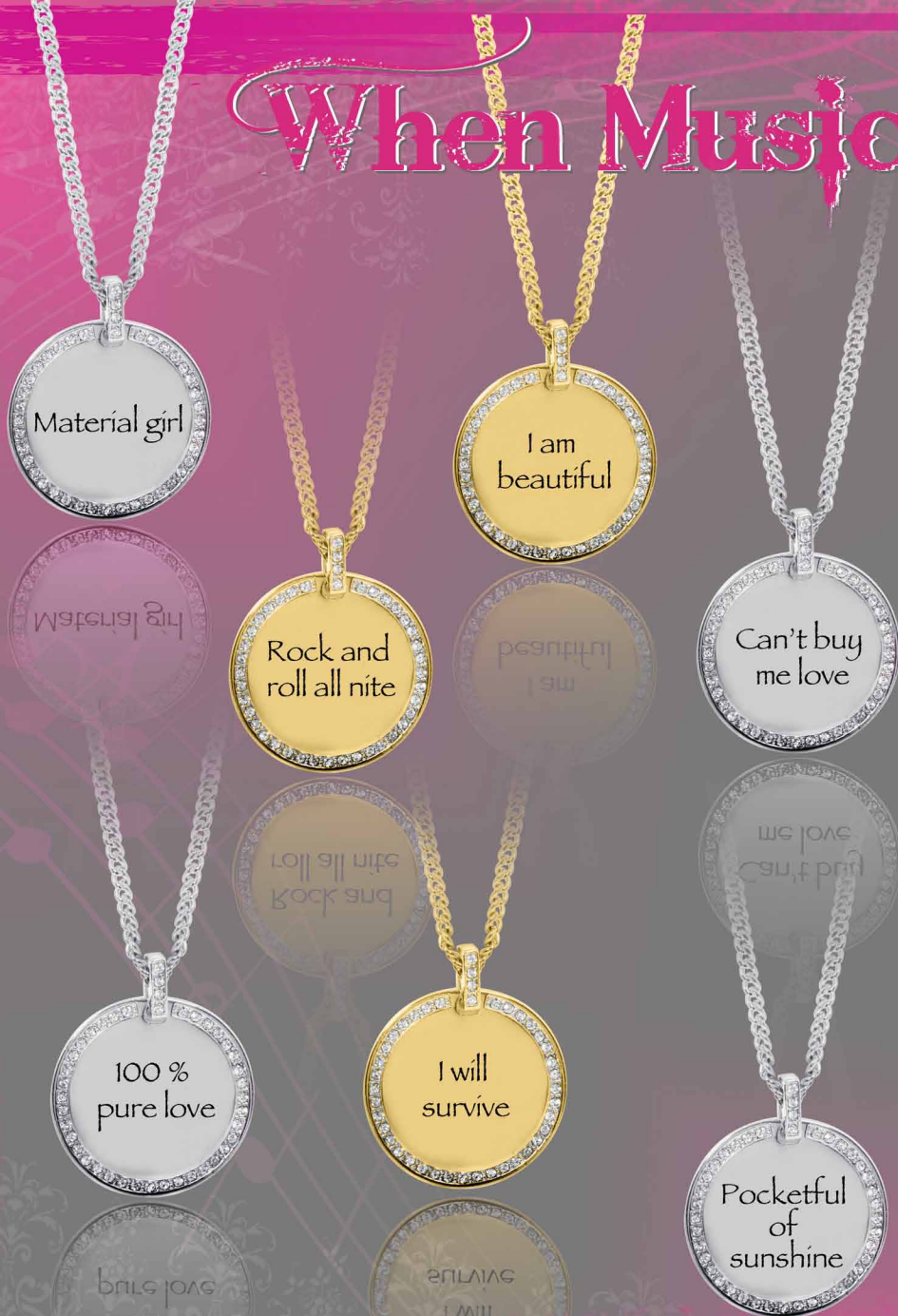
Crystal Coin Necklaces $6