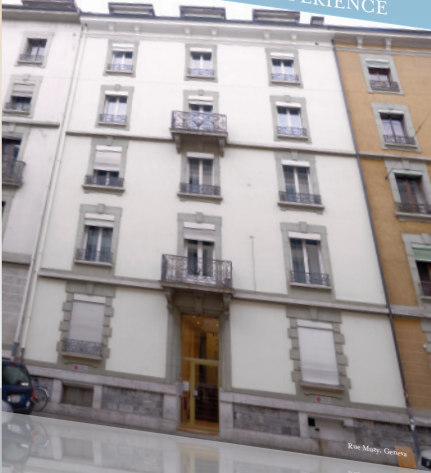
Rue Mary, Geneva Rue Mary, Geneva