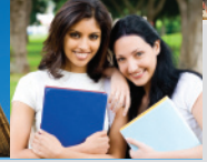
Cover, Kensington, London