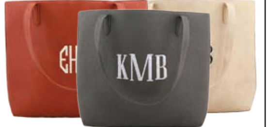
LUXE LARGE TOTE BAG $56 embroidery included