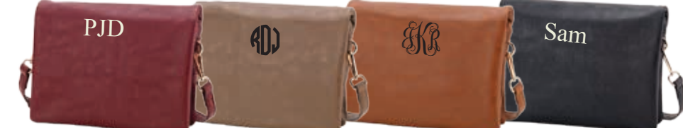
PALMER CROSSBODY $33.95 add embroidery for $10