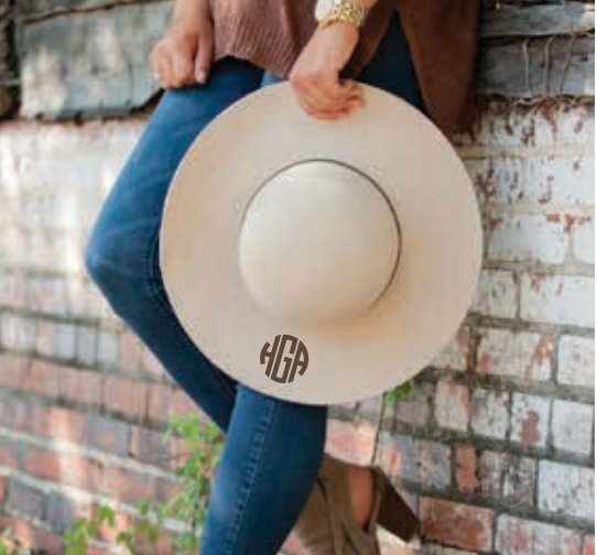
Our favorite statement piece!