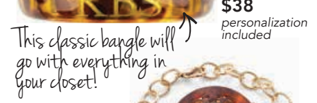
EVERLY BANGLE $38 personalization included