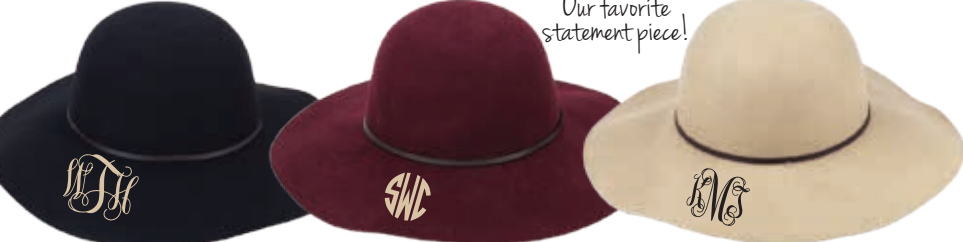
WOOL FLOPPY HAT $24.95 add embroidery for $10