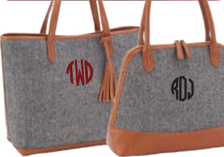
TOWNSEND ZIP POUCH $14.95 add embroidery for $10 TOWNSEND TOTE $44.95 add embroidery for $10 TOWNSEND PURSE $40.95 add embroidery for $10