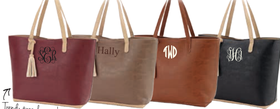
Trendy tassel accent! AUBREY PURSE $38.95 add embroidery for $10