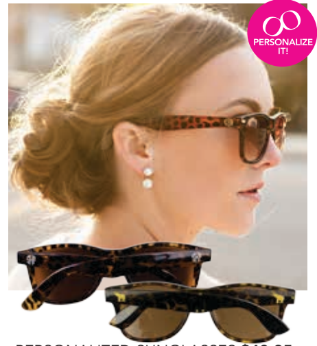
PERSONALIZED SUNGLASSES $48.95 personalization included