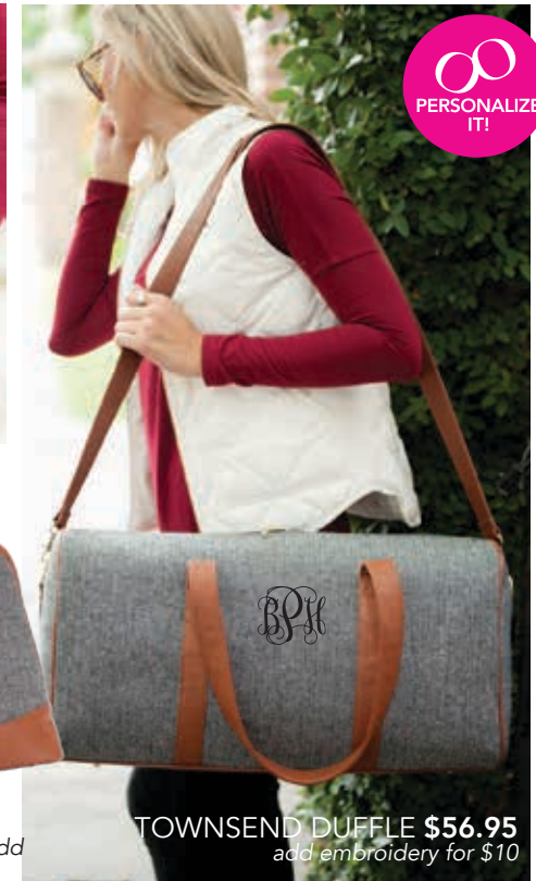
TOWNSEND DUFFLE $56.95 add embroidery for $10