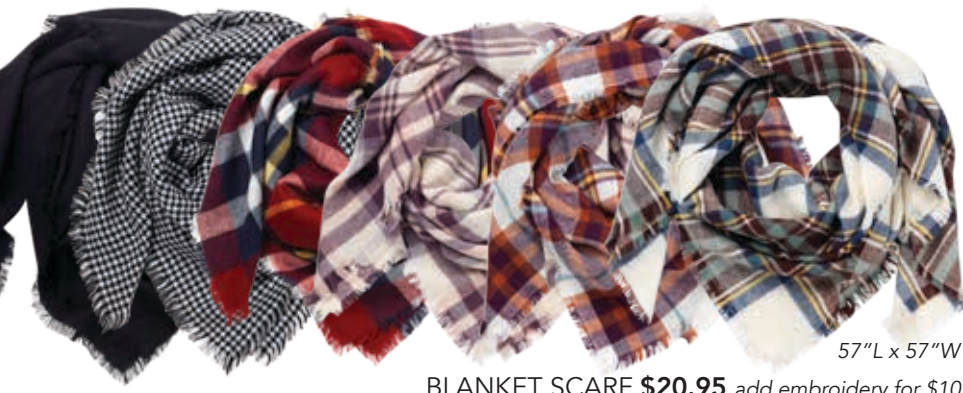
57"L x 57"W BLANKET SCARF $20.95 add embroidery for $10