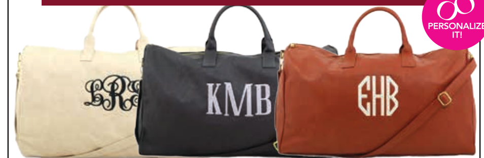
LUXE DUFFLE $92 embroidery included