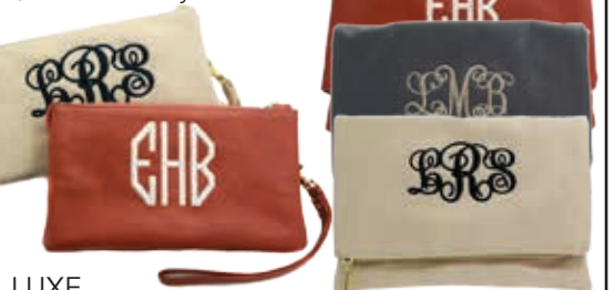
LUXE WRISTLET $49 embroidery included