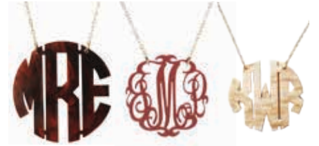
ACRYLIC MONOGRAM NECKLACE starting at $58.95 personalization included