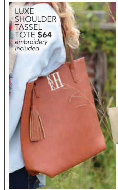
LUXE SHOULDER TASSEL TOTE $64 embroidery included