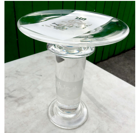
Buy this one of a kind piece in the Hot Shots auction.