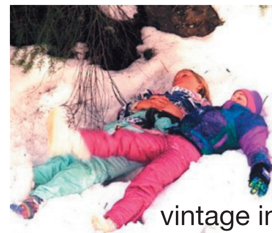
vintage inspired detail for outdoor play