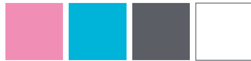
snowbunny down group