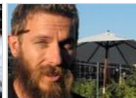
Inside Uncommon Ground's Rooftop Farm

About The Feast • Terms of Service • Privacy Policy • Contact Us • FAQ • Advertisers