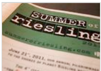
Last Chance For Summer of Riesling