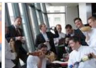
Who's Who at the Revamped NoMI Kitchen