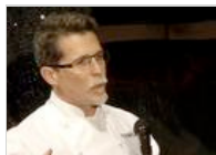
Rick Bayless Dabbles In Theater