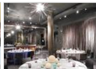
Tour Sepia's New Glam Private Dining