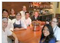
Part-Time Models, DJs at C-House