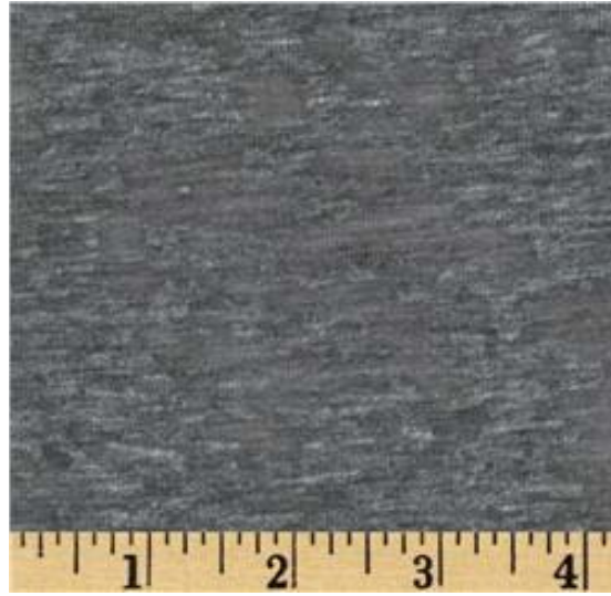
GREY STRETCH KNIT