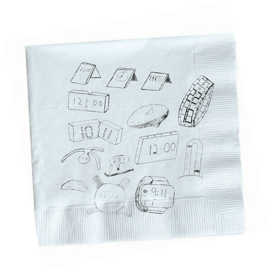
Early concept sketches.

This was a short project during junior year. We did two rounds of sketching, chose a design and created a final design in a span of about two weeks.