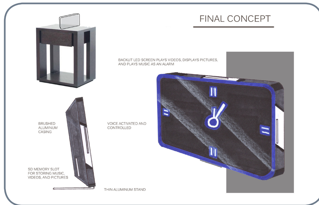
Final CAD model rendering.