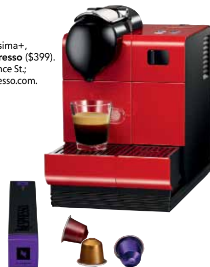
Lattissima+, Nespresso ($399). 92 Prince St.; nespresso.com.