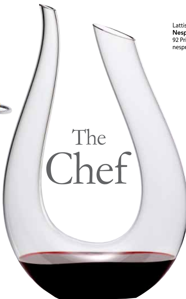
Black Tie Amadeo decanter, Ridel ($495). Bed Bath & Beyond, 270 Greenwich St.; ridel.com.