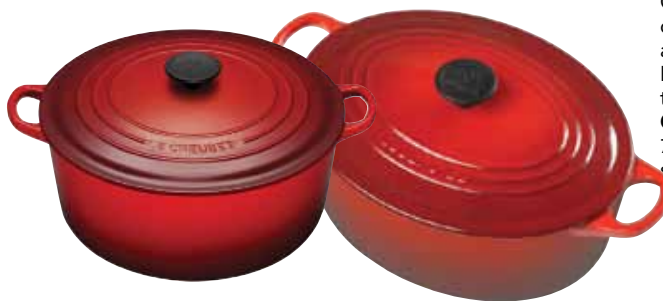
Cherry round French ovens ($145 to $410) and Cherry oval French ovens ($200 to $340), both Le Creuset . Sur La Table, 75 Spring St.; lecreuset.com.