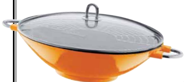
Chambord enameled cast-iron wok, Bodum ($120). bodum.com.