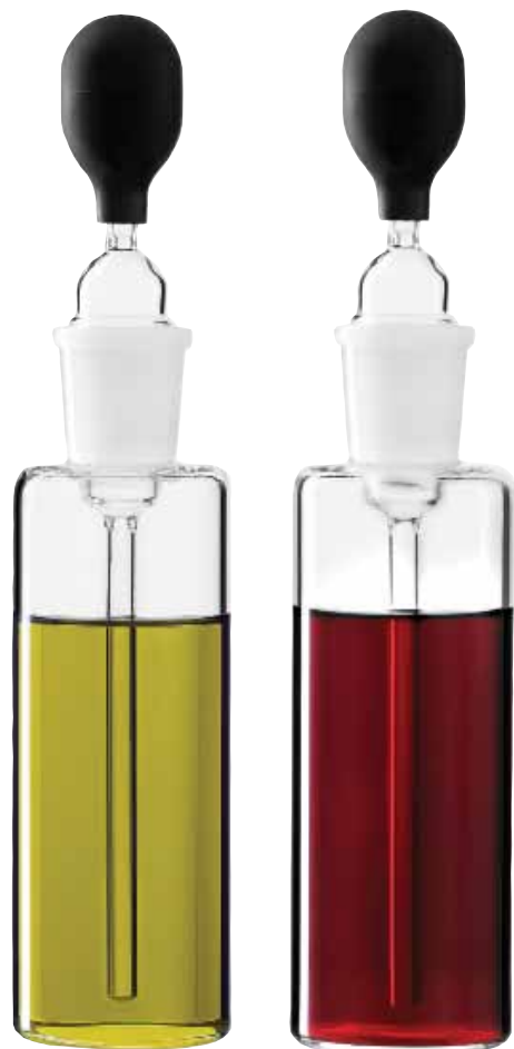
Pipette oil and vinegar bottles, Camilla Kropp ($60). Property Furniture, 14 Wooster St.; propertyfurniture.com.