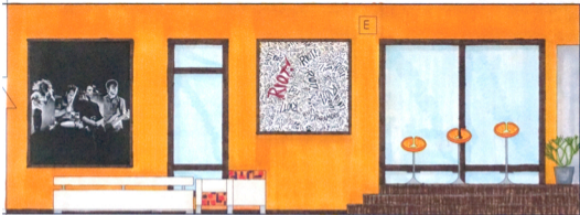
ELEVATION 2 ORIGINAL SCALE: 3/8"=1'-0"