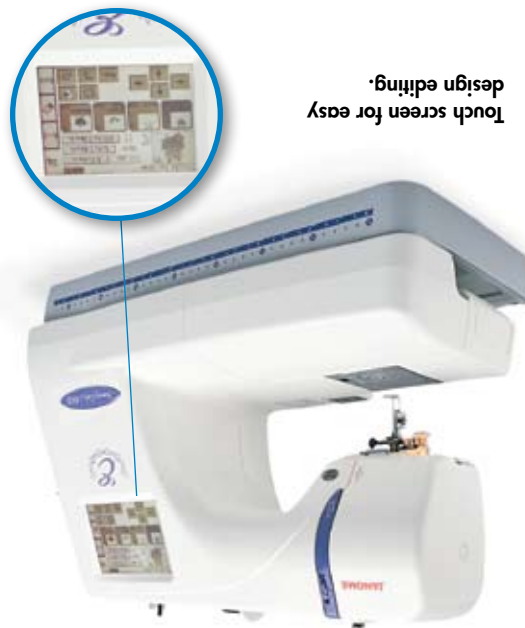
Touch screen for easy design editing.