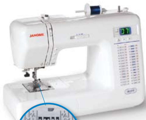
Superior Feed System contacts the fabric at 7 specific points