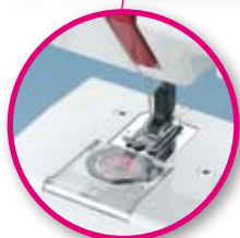
Top drop-in bobbin