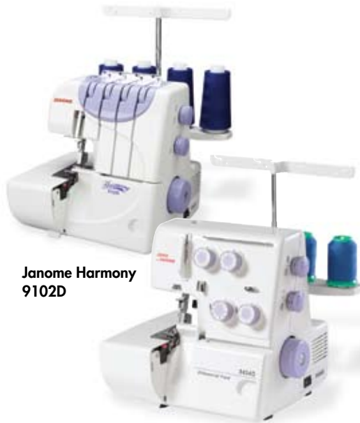
Janome Harmony 9102D