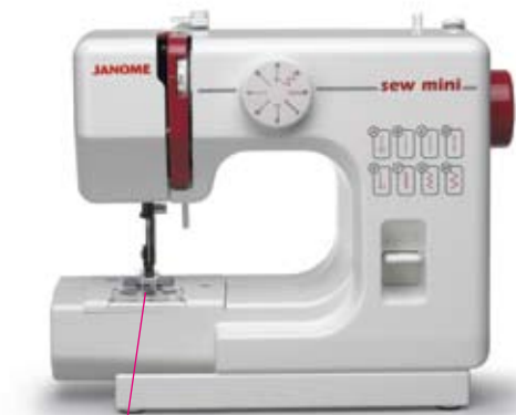
Great starter model