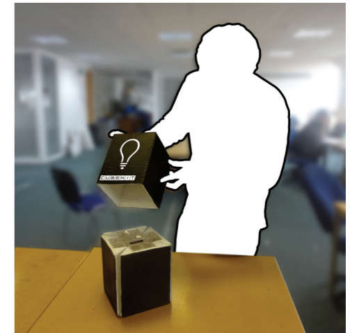
First contact with the product