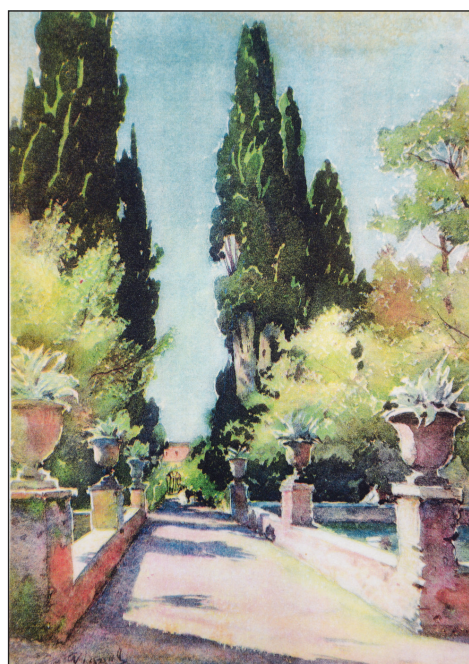
The images are just some of the donated artwork that will be available for purchase at the Jan. 26 fundraiser at the Redondo Beach Women's Club.