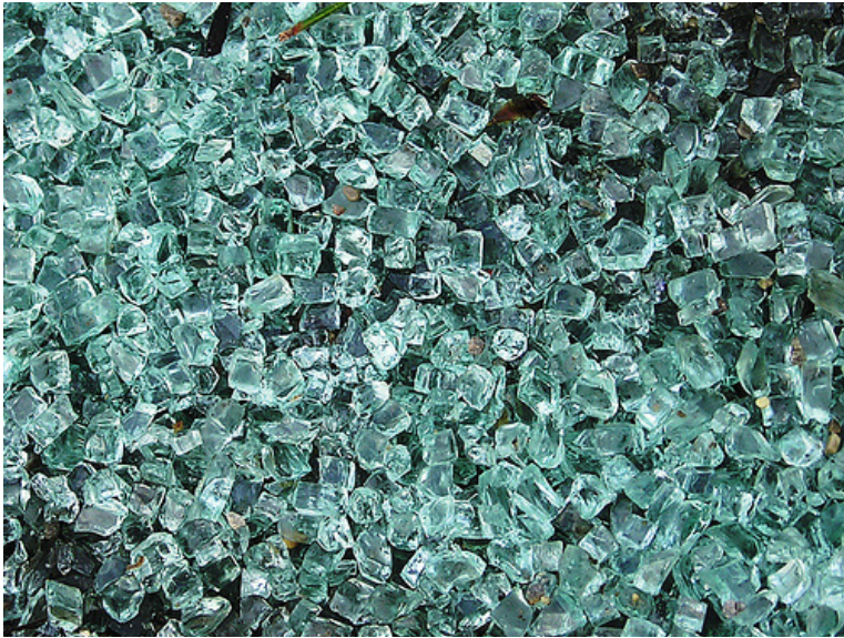
Danny Lanes chair materials, glass and steel, were chosen to be used. A car break in inspired the specific glass to be broken tempered glass.