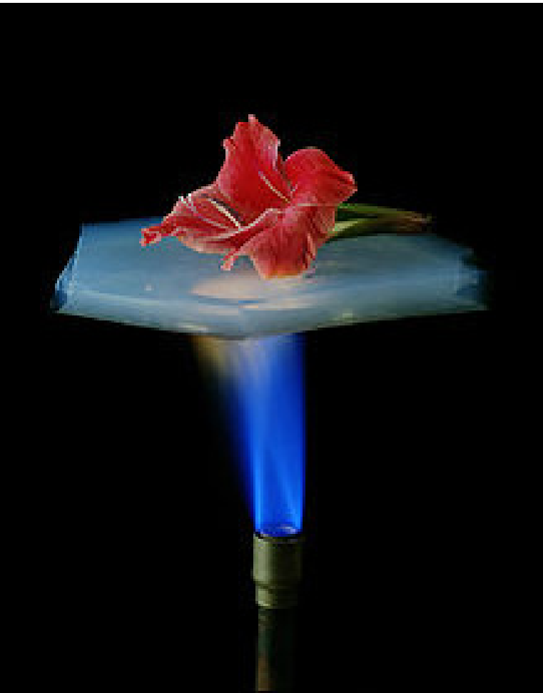
X-aerogels is a flexible material that is cloudy see through with a light blue tint which would compliment the glass. It is a great insulator and very strong for its light weight.