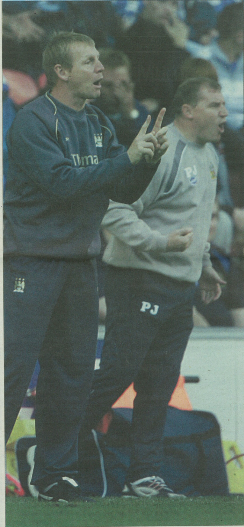
Ex-Wigan boss Paul Jewell, right, has been linked with Pearce's City job

despite guiding the club to the Champions League semi-finals. One of the other leading candidates to take charge at City, former Bolton manager Sam Allardyce, is expected to be named Newcastle boss today.