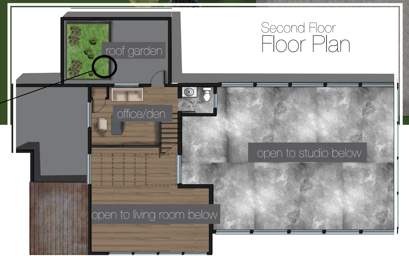
Second Floor Floor Plan