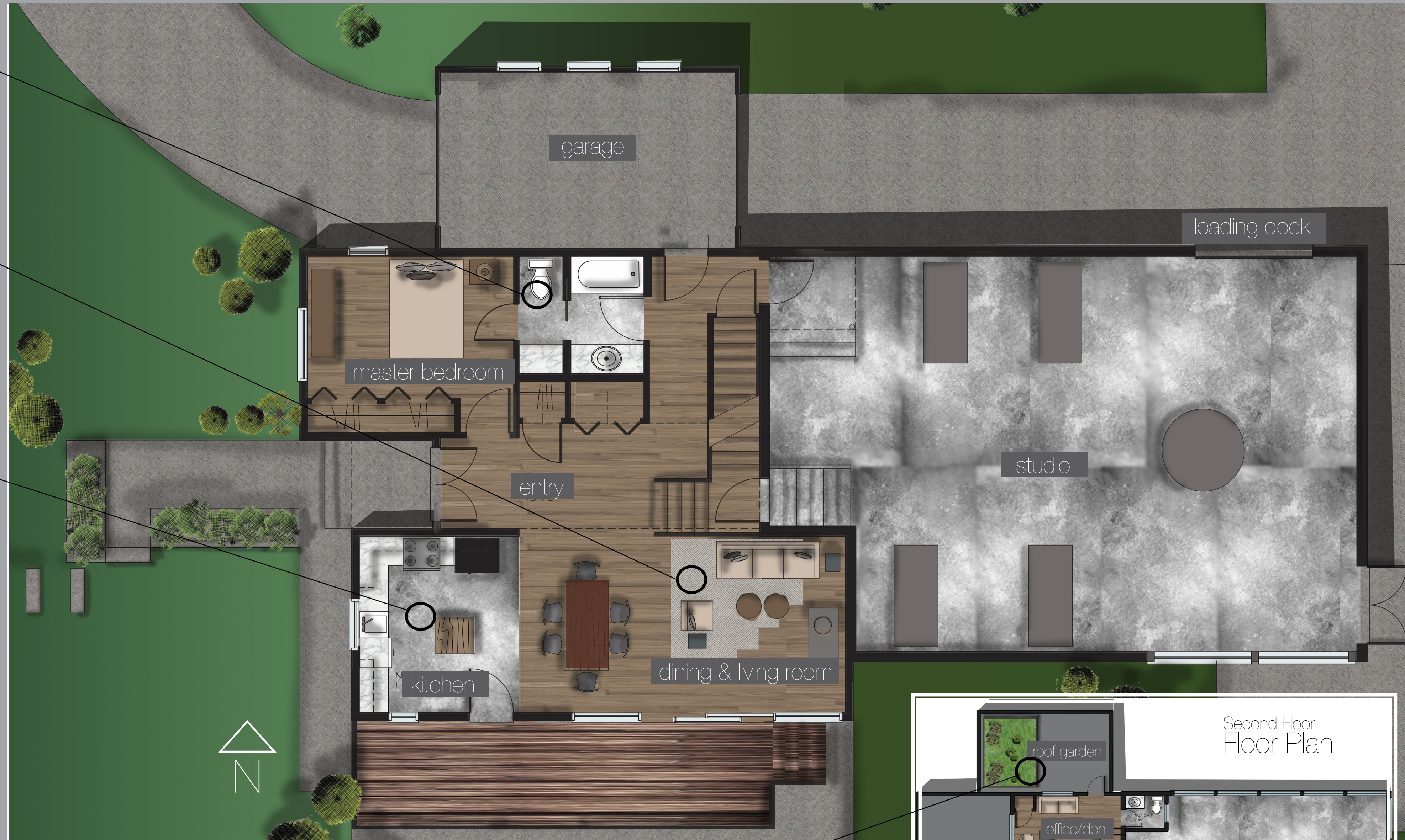
on Site Floor Plan

can be made with recycled waste materials - additionally, the primary raw material in concrete is limestone, which is very abundant