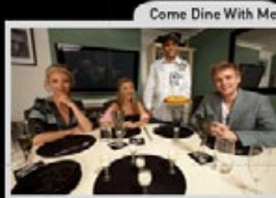
Come Dine With Me