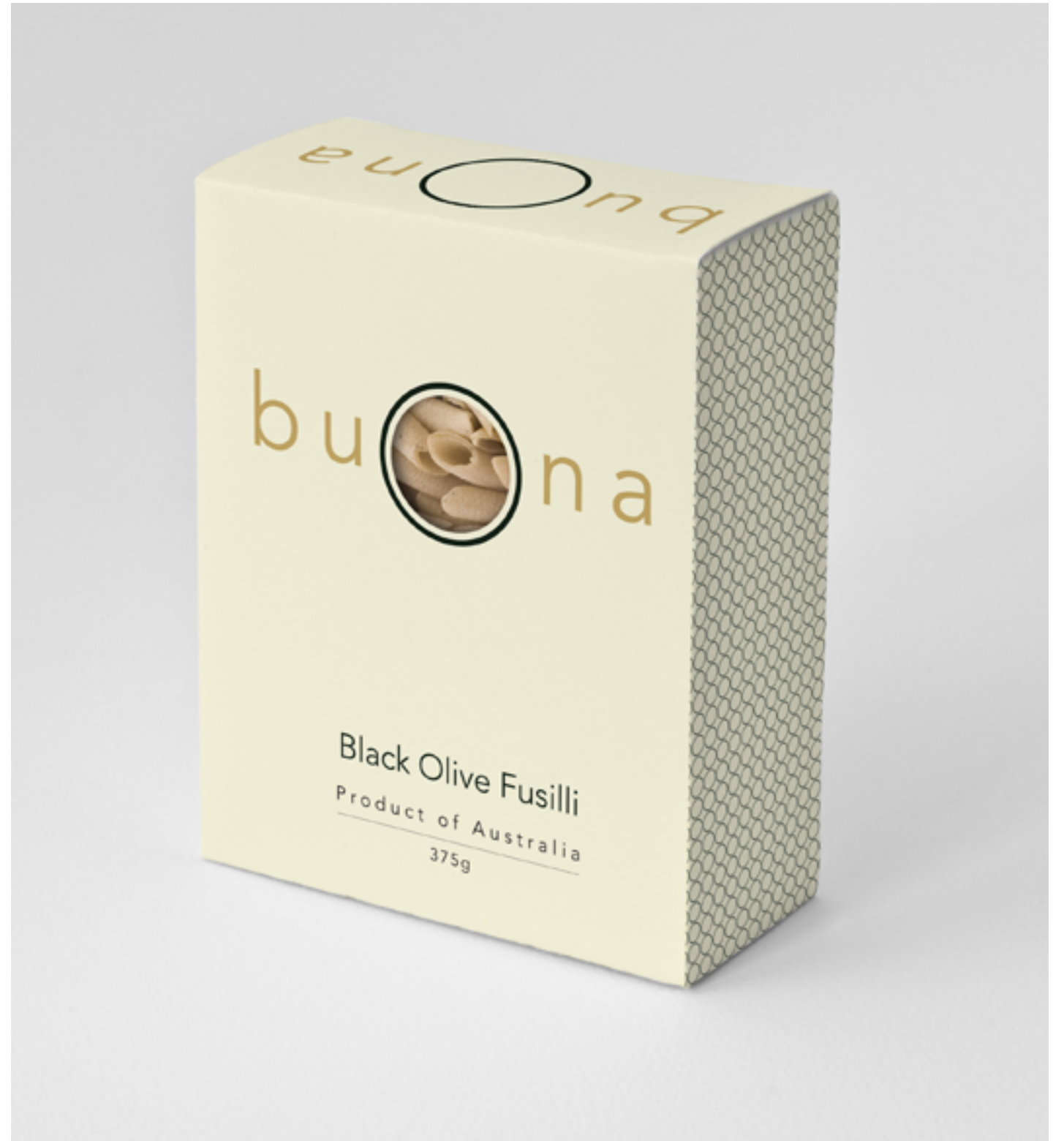
BUONA PASTA PACKAGING/IDENTITY BRANDING