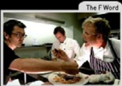
The F Word