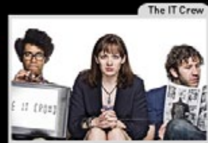
The IT Crew