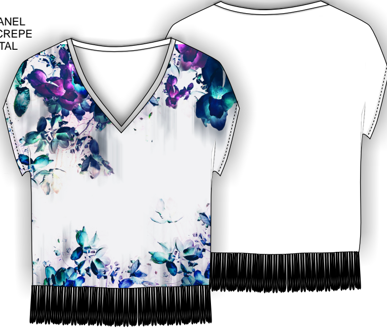
4" FRINGE LACE

FRONT PANEL IN POLY CREPE FOR DIGITAL PRINT