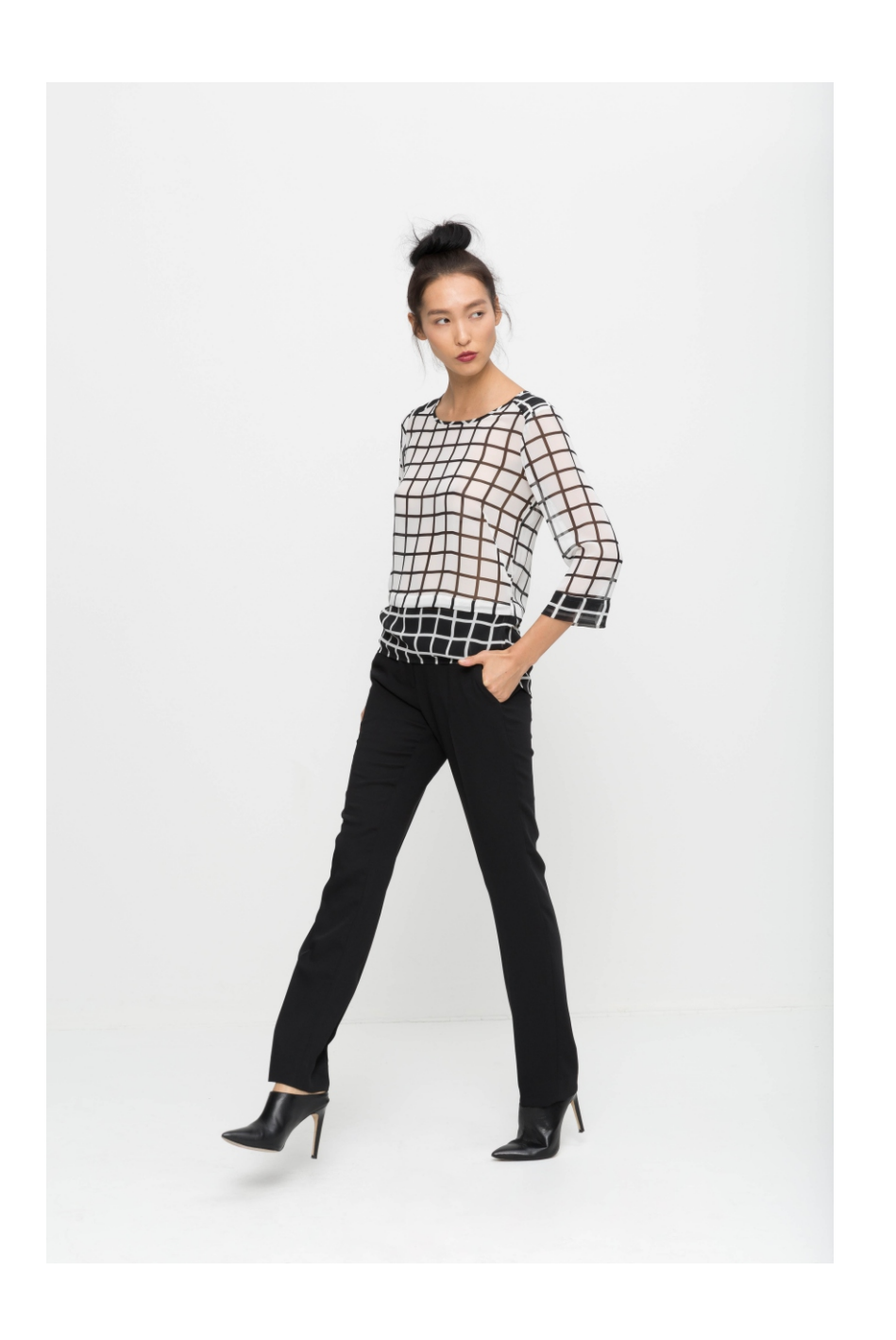
R 0 & D E