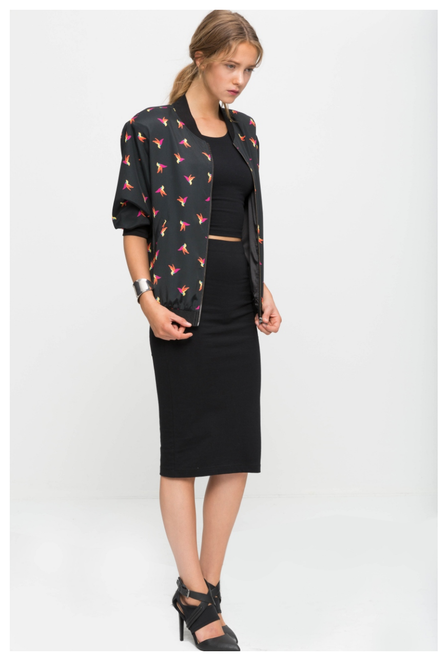
R O & D E