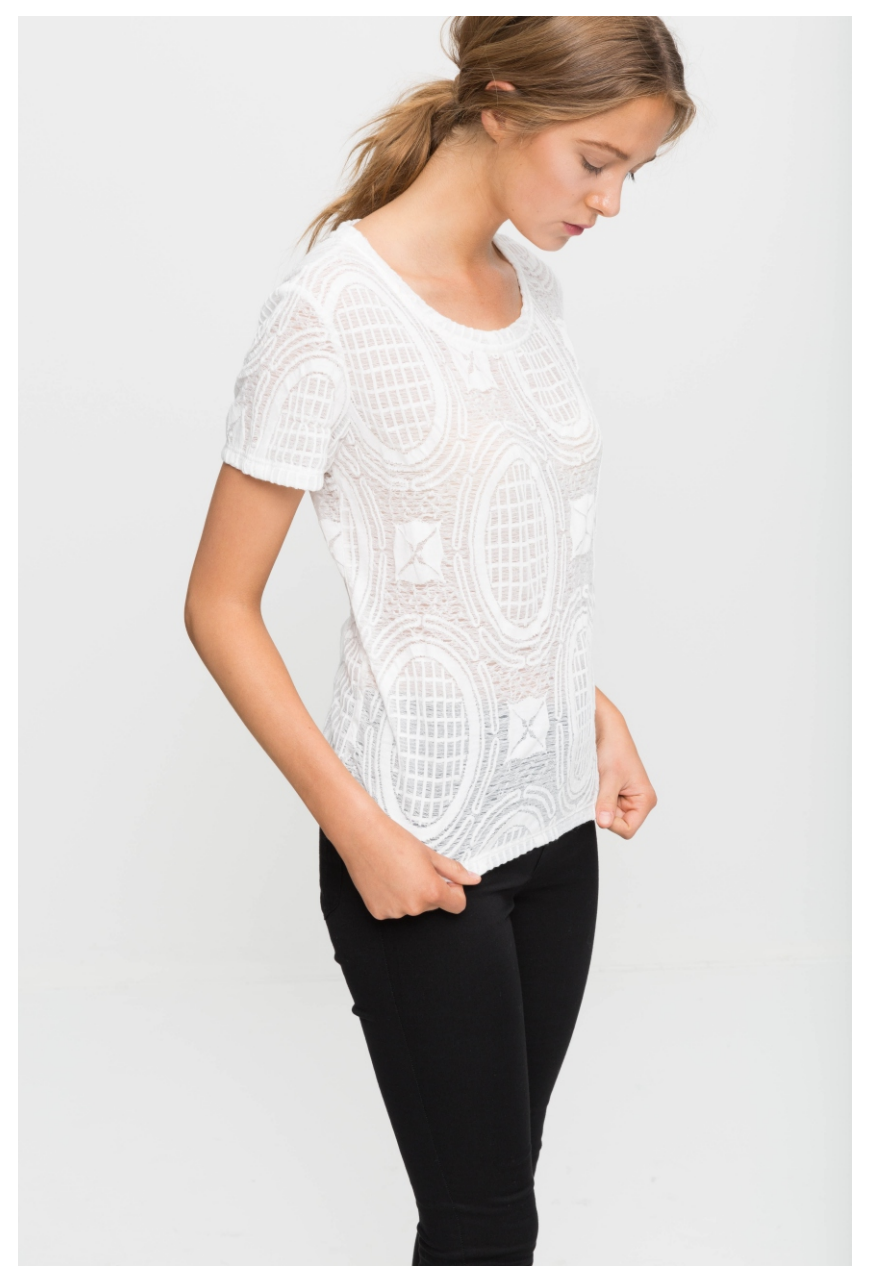
R 0 & D E