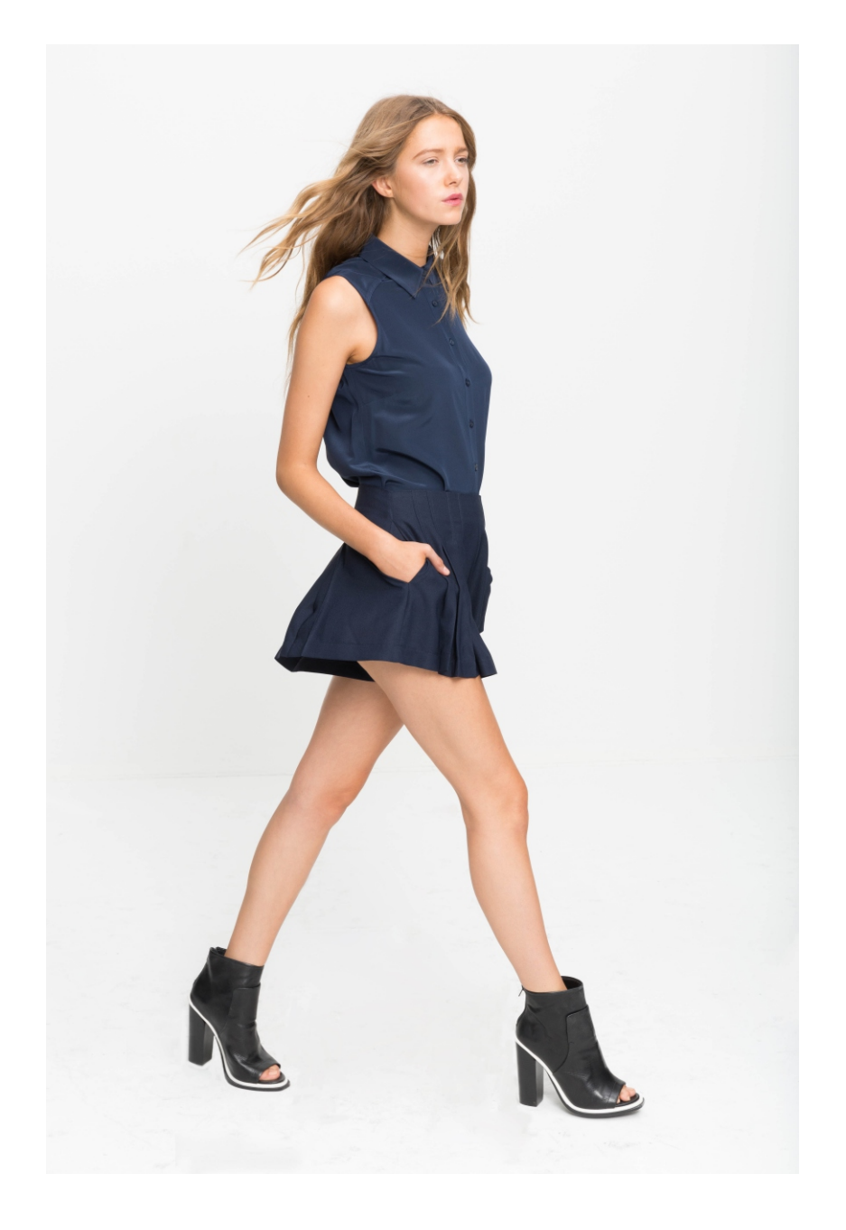
R 0 & D E