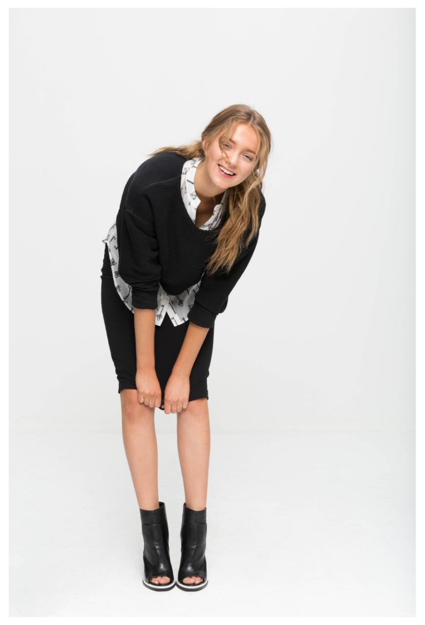
R 0 & D E