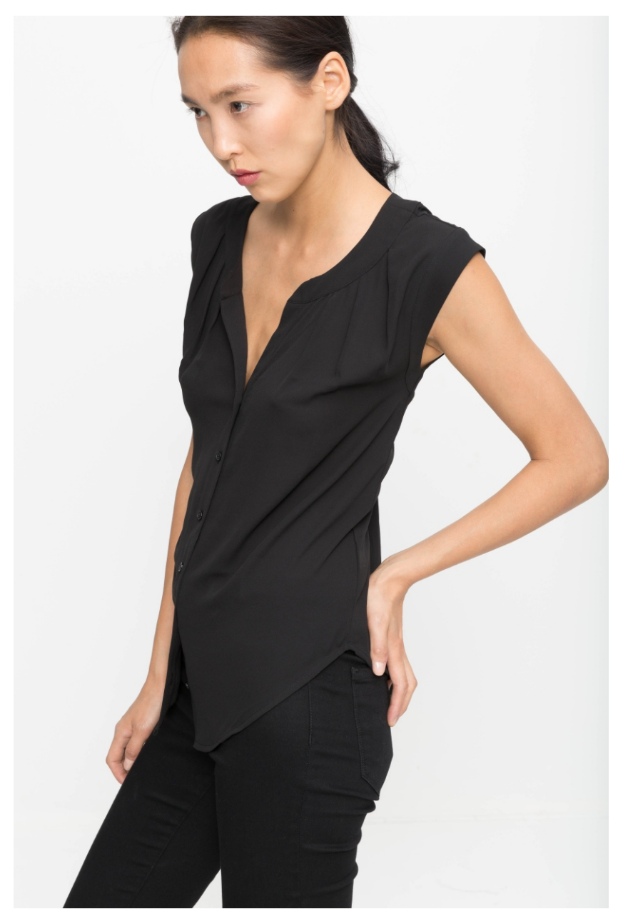
R 0 & D E