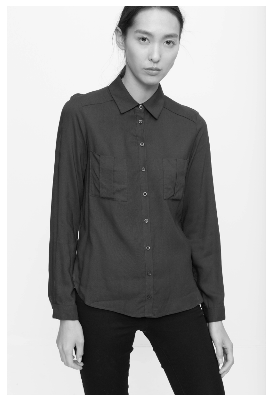
R 0 & D E