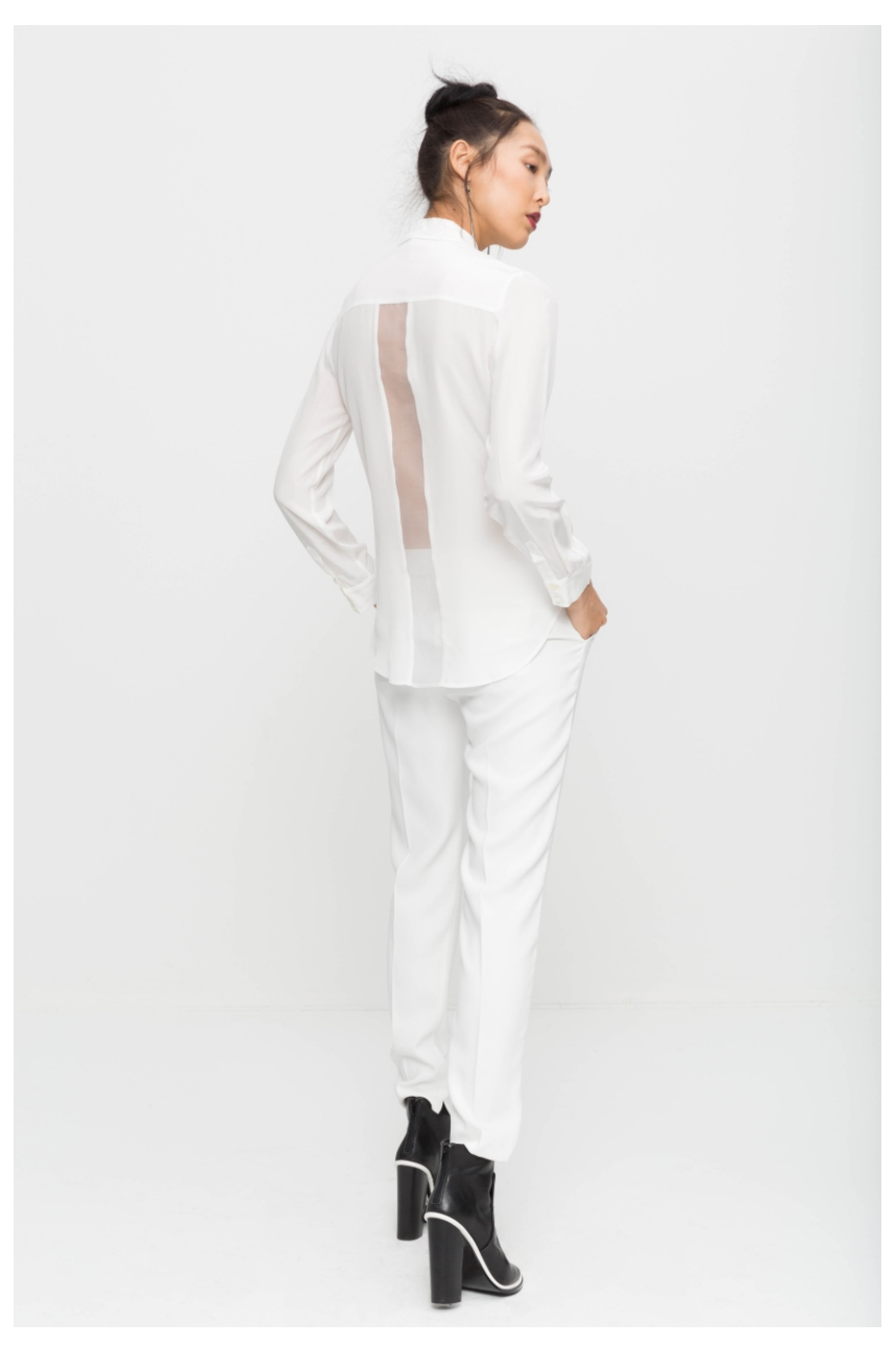
R O & D E